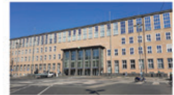
University of Cologne, Germany