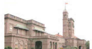
Savitribai Phule Pune University