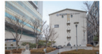
Yonsei University Medical Center, South Korea