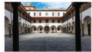
University of Pisa, Italy

Osh State University, Kyrgyzstan: ASMI has established ties with Osh State University to facilitate academic exchanges and collaborative research.