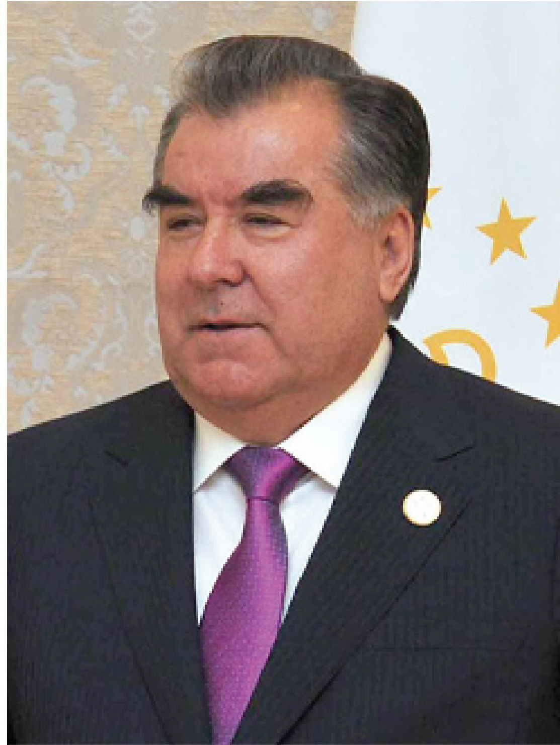
His Excellency Mr. Emomali Rahmon Hon'ble President of Republic of Tajikistan