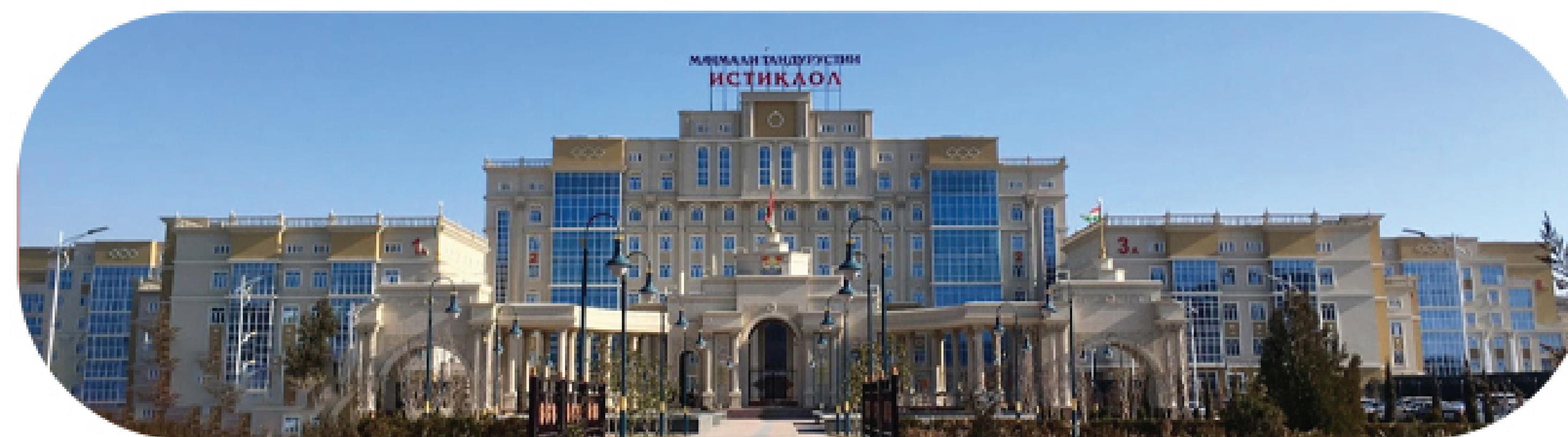
(Tajik National University, Practice Hospital)