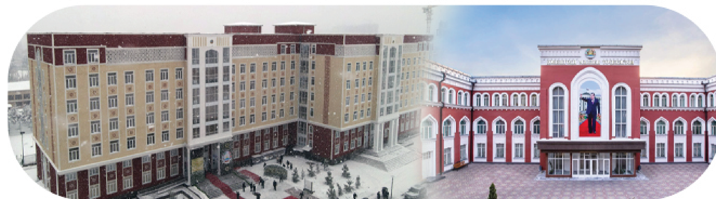
(Tajik National University, Campus)