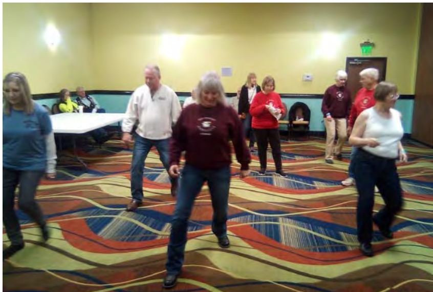
Learning to line dance