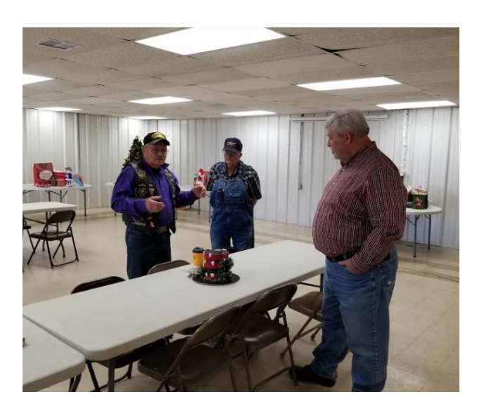
Chapter P had a Ride to Auntie C's for Breakfast