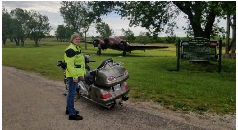
A ride off to Fall River