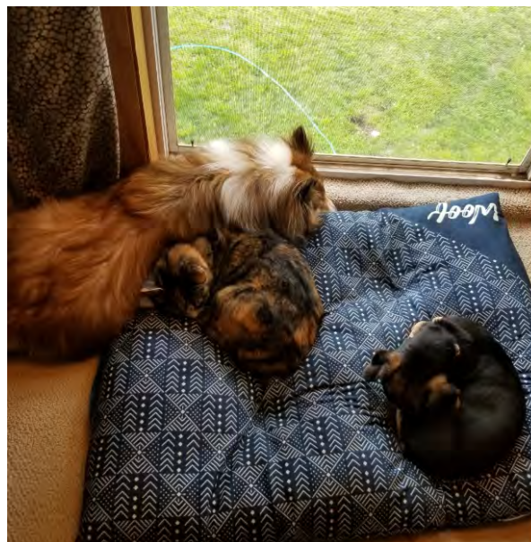
Sierra Rose-our Sheltie, Sniffy-our Calico cat, Reese-our Morki and Daisy-our Chihuahua