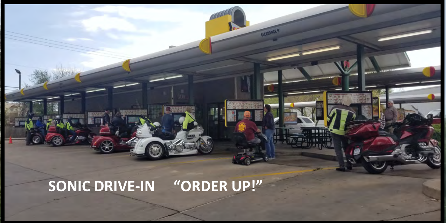
SONIC DRIVE-IN "ORDER UP!"