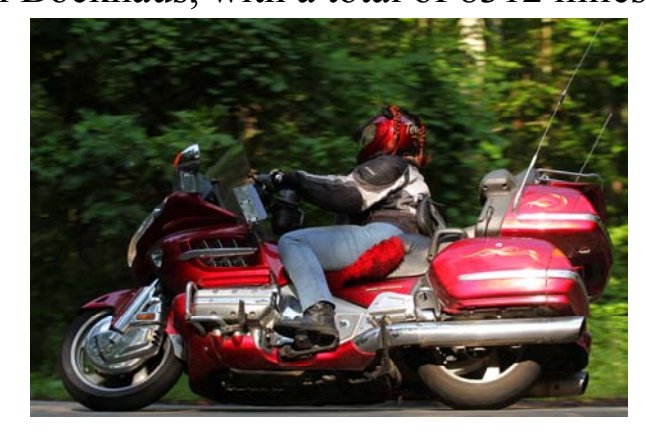
Continued on Page 32

Next in line for high mileage for the males is Steve Bockhaus, with 8951 miles. The top female mileage goes to yours truly, Terri Bockhaus, with a total of 8312 miles.