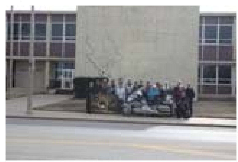
KSQ's Court House Ride Kick Off