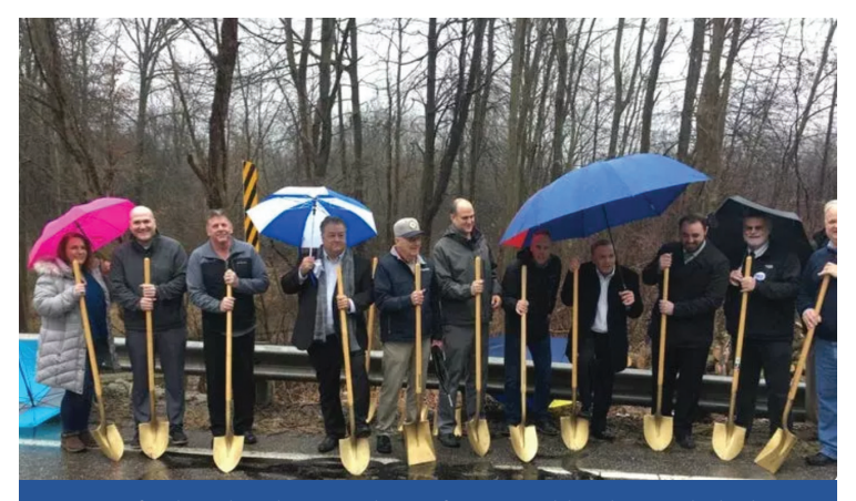
County officials gathered in a steady rain for a ground-breaking at the bridge site on Brunstetter Road in Weathersfield Township.

"The local contribution is a little under $100,000 between