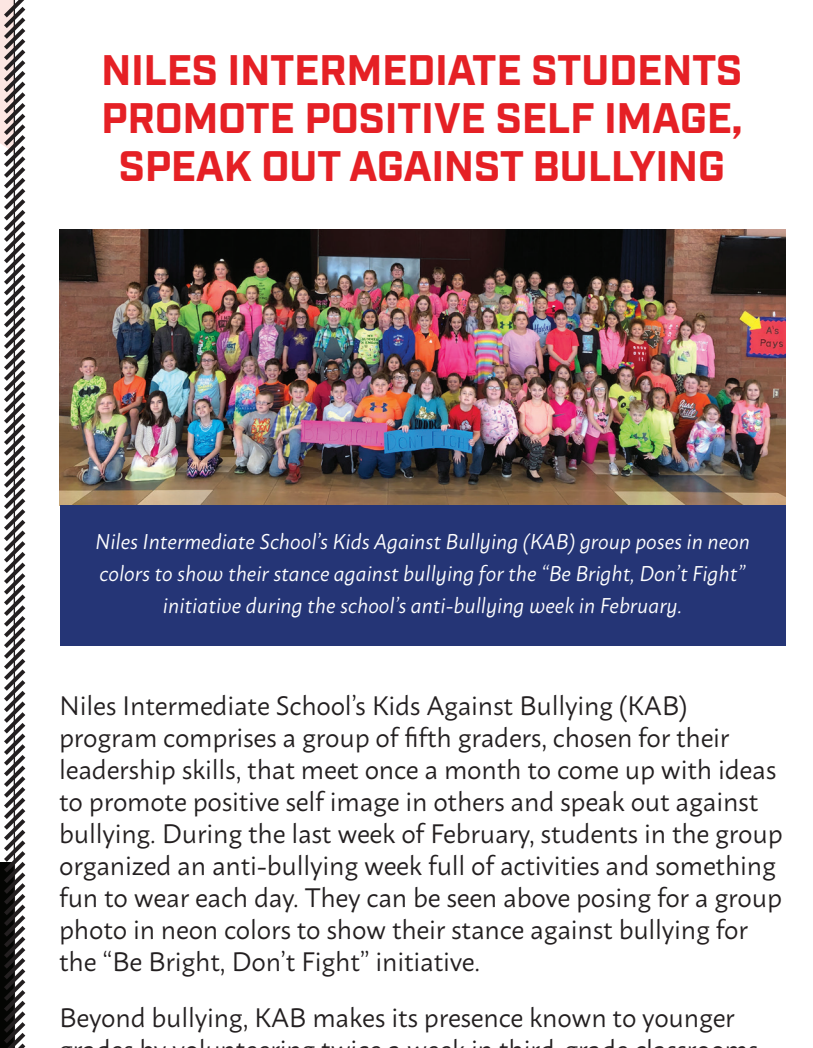
Niles Intermediate School's Kids Against Bullying (KAB) group poses in neon colors to show their stance against bullying for the "Be Bright, Don't Fight" initiative during the school's anti-bullying week in February.

Niles Intermediate School's Kids Against Bullying (KAB) program comprises a group of fifth graders, chosen for their leadership skills, that meet once a month to come up with ideas to promote positive self image in others and speak out against bullying. During the last week of February, students in the group organized an anti-bullying week full of activities and something fun to wear each day. They can be seen above posing for a group photo in neon colors to show their stance against bullying for the "Be Bright, Don't Fight" initiative.