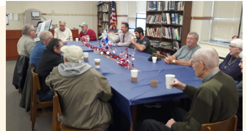
Community Veterans share stories and enjoy breakfast.