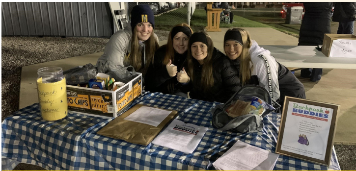
Junior students collect money and materials for the elementary school's Backpack Buddies program.

club is organized and operated by the Grade 6 Multi-Media Club students.