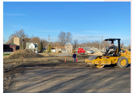
Construction is underway for the new Multi-Jurisdictional Opioid Education and Workforce Development Center at Gazebo Park.

God bless our first responders and keep them safe! ■