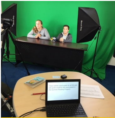
Roosevelt students film and edit the morning newscast.