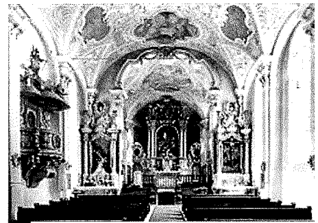
Interior of the Sanctuary