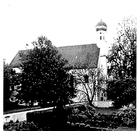
Sanctuary of the Most Precious Blood

A poor peasant of Erding could find no way to improve his economic state, despite working many hours every day. His neighbor on the other hand, who did the same work, succeeded in living prosperously. One day the peasant asked his neighbor how he had succeeded in earning so much and the man confided to him that his success was owed to the fact that he kept the Blessed Sacrament in his house. The poor peasant, ignorant in the faith, thought that the Blessed Sacrament was a type of amulet, and decided to imitate his neighbor. He went to Mass on Holy Thursday and after having received Communion, hid the Host in his clothes and left the church with the Holy Eucharist. During his journey, however, his conscience began to accuse him, so he decided to bring the Sacred Particle back. During the trip, however, the Host slipped