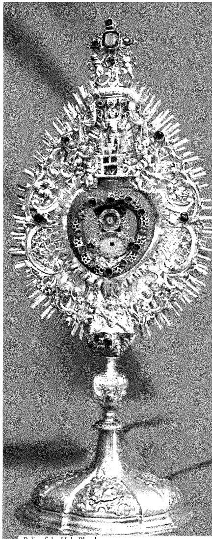
Relic of the Holy Blood

On Holy Thursday 1417 a peasant stole a consecrated Host, which, in the course of his journey, escaped from his hands and flew away in the air. He tried in vain to catch the Sacred Host. It was only thanks to the direct intervention of the Bishop that he was able to recover the Sacred Particle. A chapel was immediately built on the site where the miracle occurred. There were many cures and wonders attributed to the veneration of this miracle.