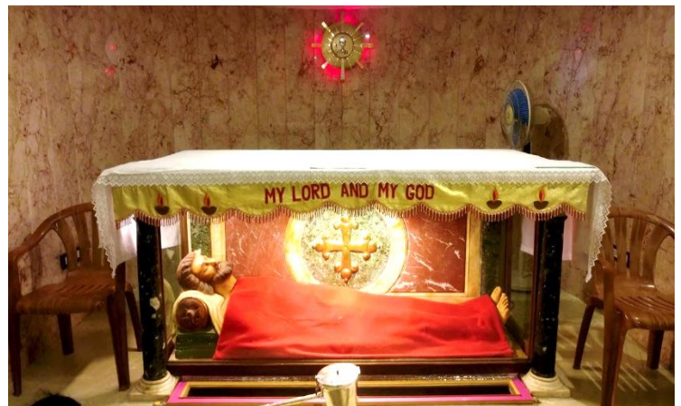
The tomb of Saint Thomas