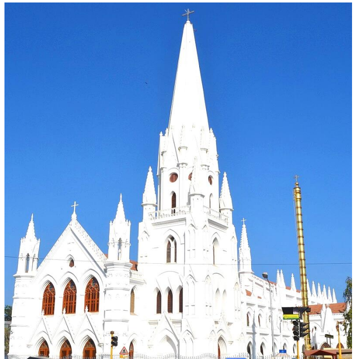
San Thome Church in Chennai, India

The purported finger bones of Saint Thomas were discovered during restoration work at the Church of Saint Thomas in Mosul, Iraq in 1964, and were housed there until the Fall of Mosul, after which the relics were transferred to the Monastery of Saint Matthew on June 17, 2014.