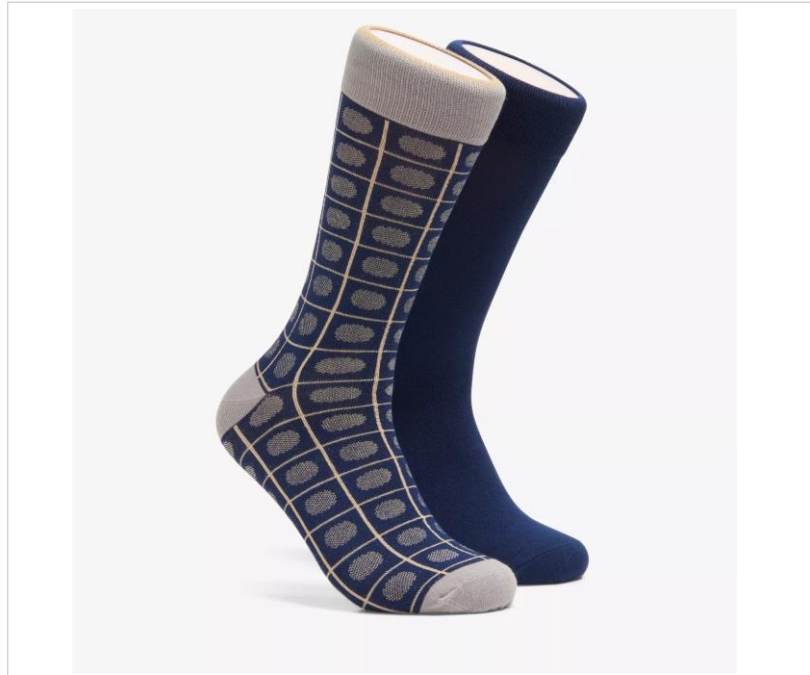
COLOR / UPC Navy Sand/Navy 889003829258