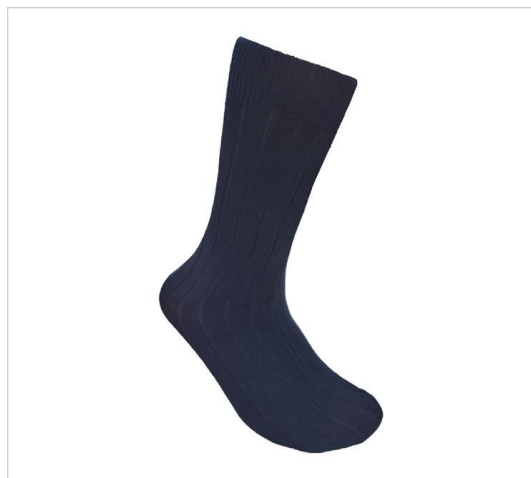
COLOR / UPC Navy 889002809114