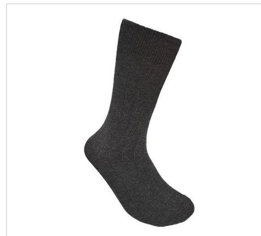
COLOR / UPC Charcoal 889002809053