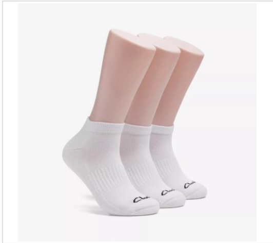
COLOR / UPC White 889003686950

DESCRIPTION 3Pk Athletic No-Show 85% Rayon from Bamboo, 10% Polyester, 5% Spandex