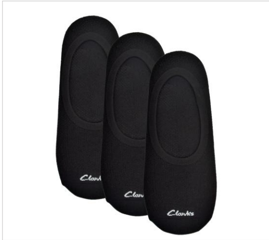
COLOR / UPC Black 889003702018