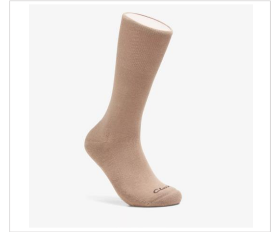
COLOR / UPC Taupe 889002809008