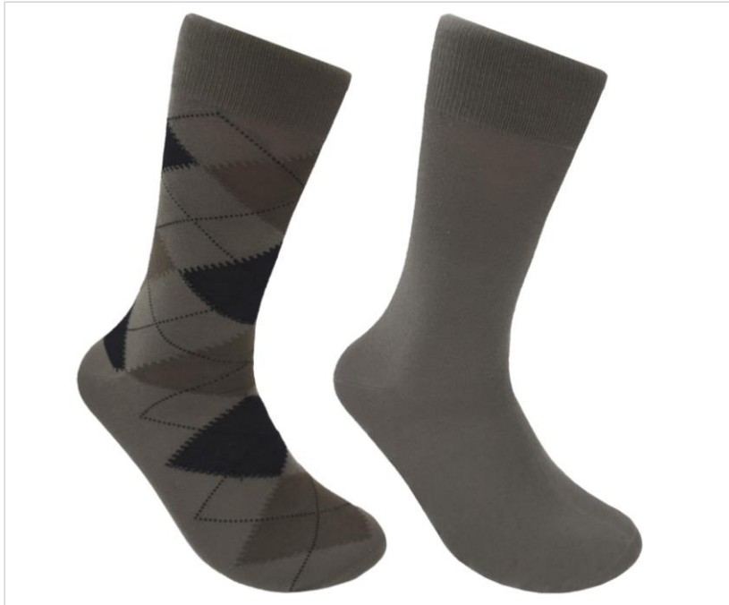
COLOR / UPC Taupe / Taupe 889003810393