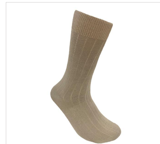
COLOR / UPC Tan 889002809077