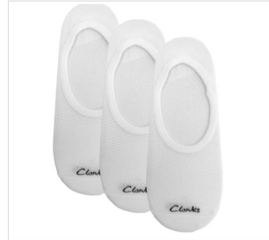
COLOR / UPC White 889004095225