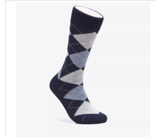
COLOR / UPC Navy 889003711119