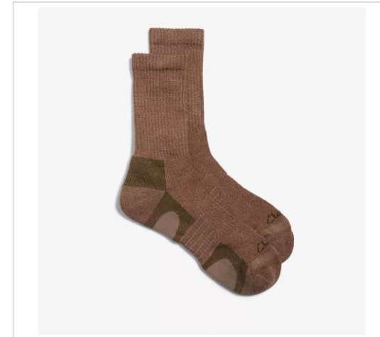
COLOR / UPC Taupe 889002811025