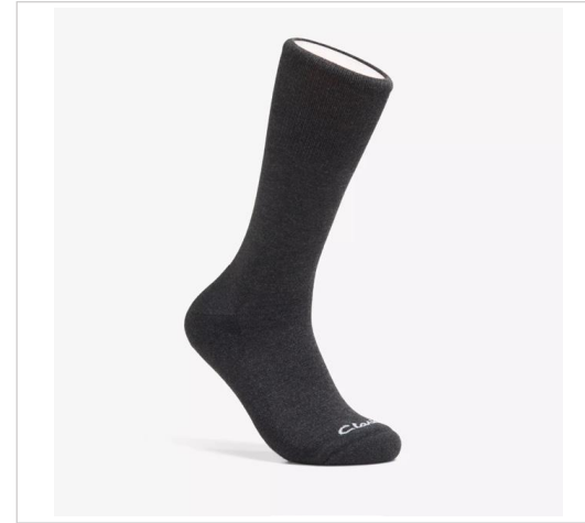
COLOR / UPC Charcoal 889002807042