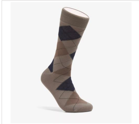
COLOR / UPC Taupe 889003711263