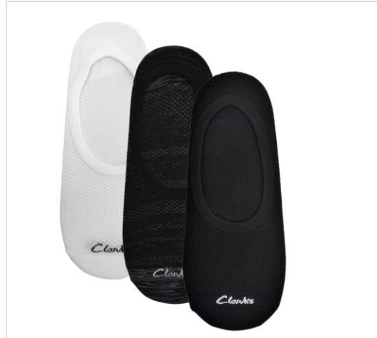
COLOR / UPC Multicolour 889002809084