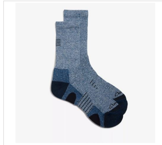
COLOR / UPC Dark Blue 889002811018