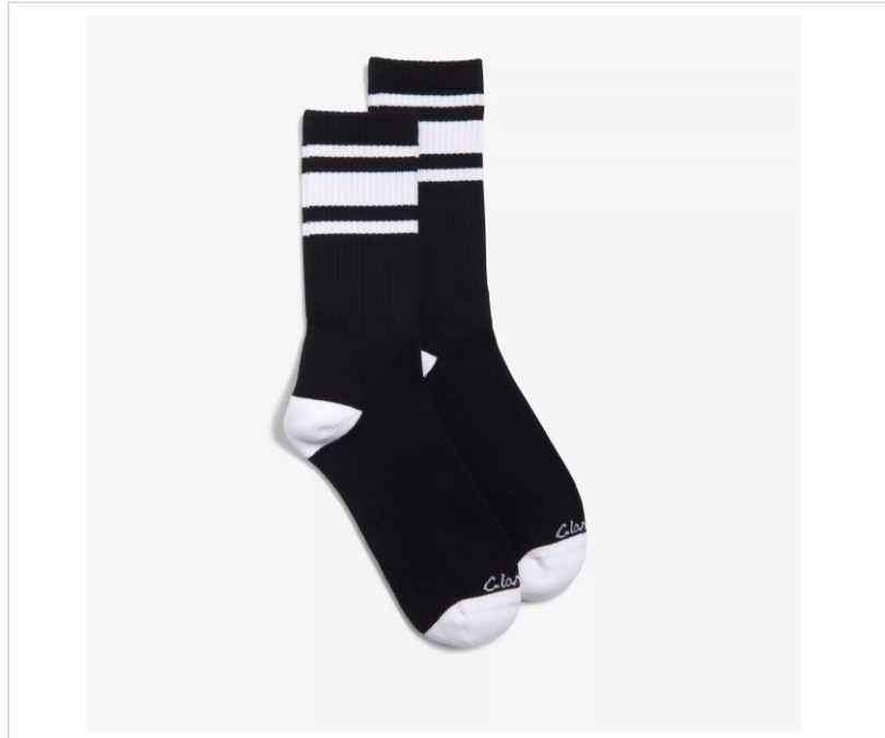
COLOR / UPC Black/White 889002825220