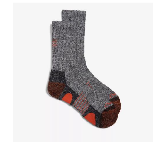
COLOR / UPC Black 889002811032