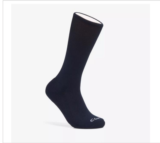
COLOR / UPC Navy 889002807059