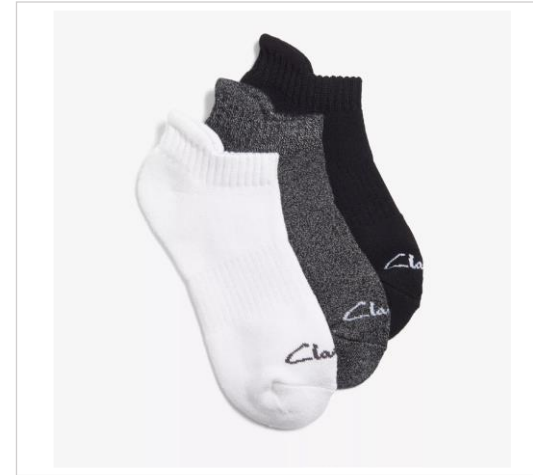
COLOR / UPC Multicolour 889002809022