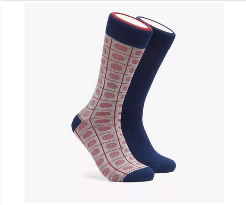
COLOR / UPC Charcoal Ruby Wine/Navy 889003828428