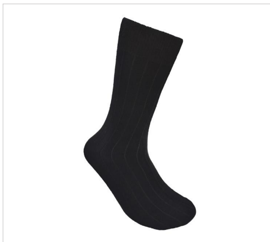
COLOR / UPC Black 889002809107