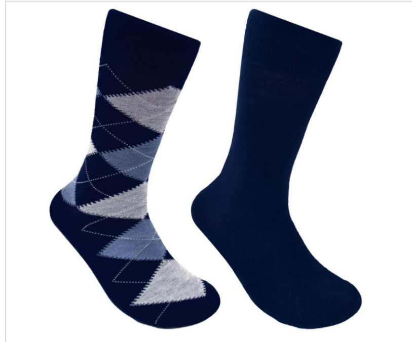
COLOR / UPC Navy / Navy 889003810386