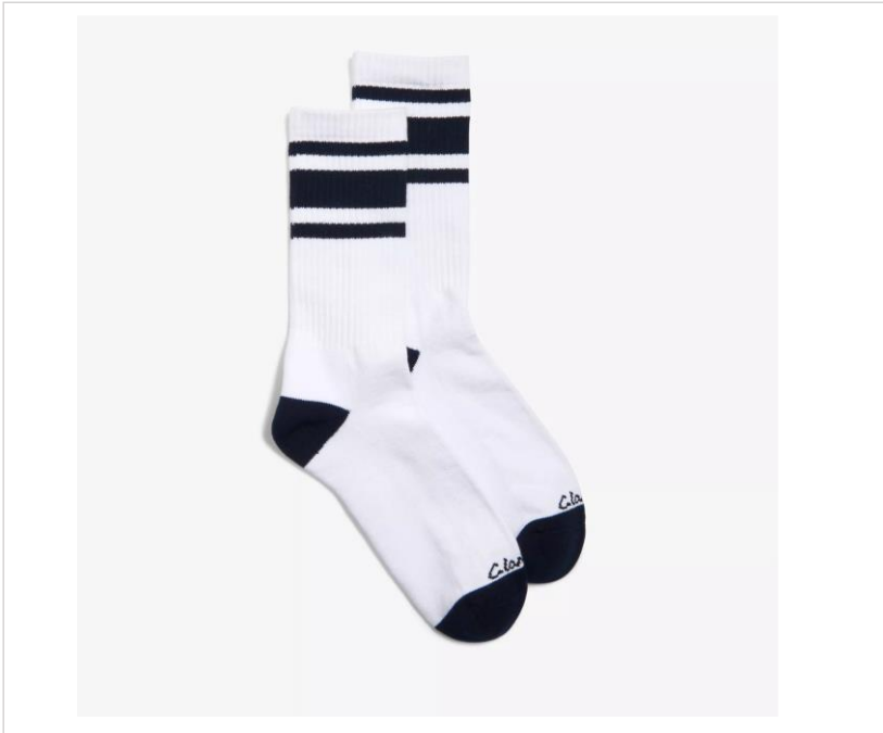
COLOR / UPC White/Navy 889002825206