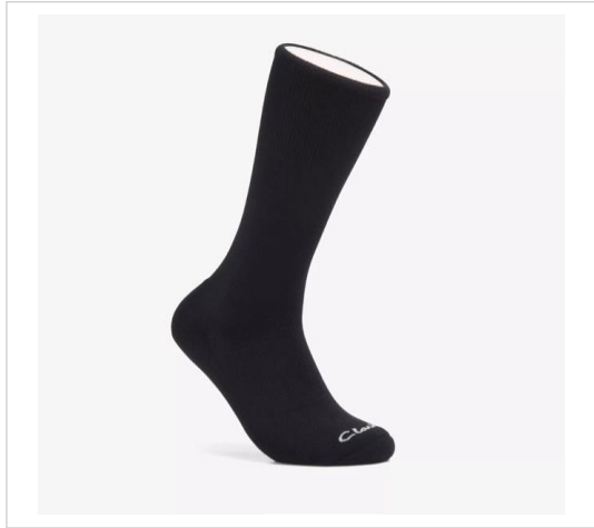
COLOR / UPC Black 889002807066