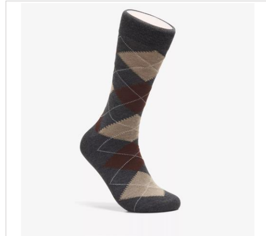
COLOR / UPC Charcoal 889003711126