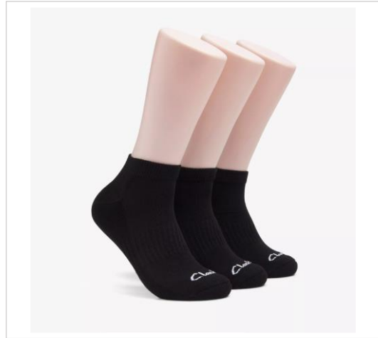
COLOR / UPC Black 889003687858