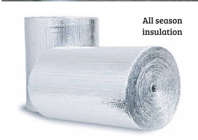
All season insulation