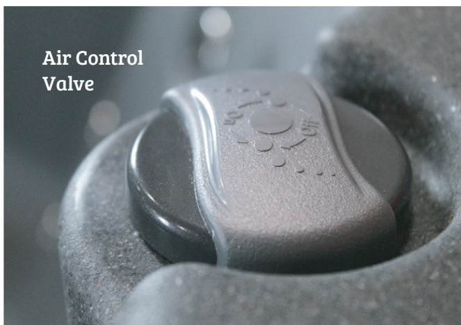
Air Control Valve