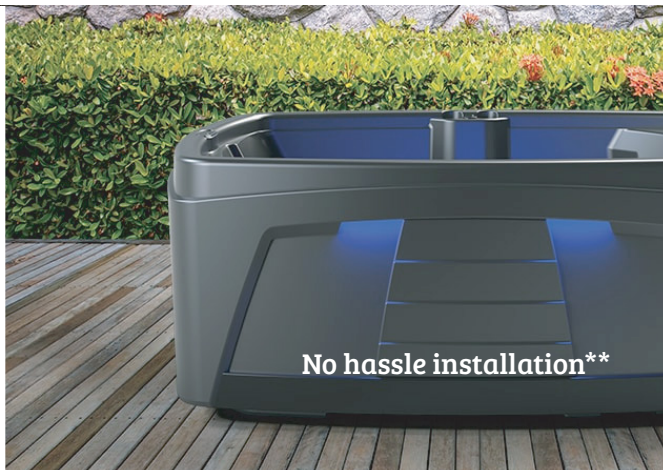
No hassle installation**