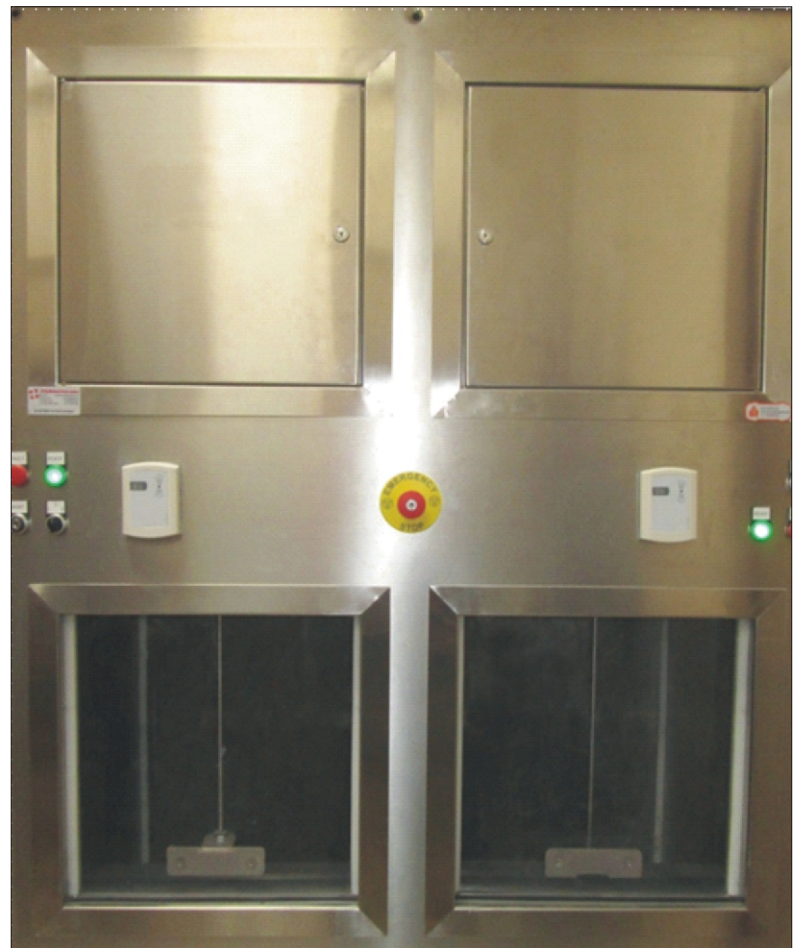
# AL DDDA Station

Air-Log International Baumschulenweg 15 26127 Oldenburg Telefon: +49 (0) 441 570 29 98-0 info@air-log.de www.air-log.de