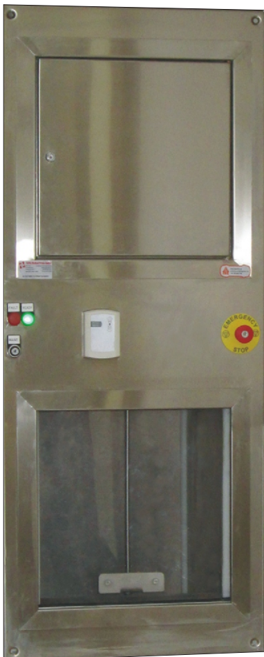
# AL DDSA Station