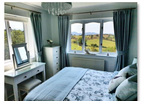
Bedroom 4 can either have a king-size bed (as here), or 2 single beds