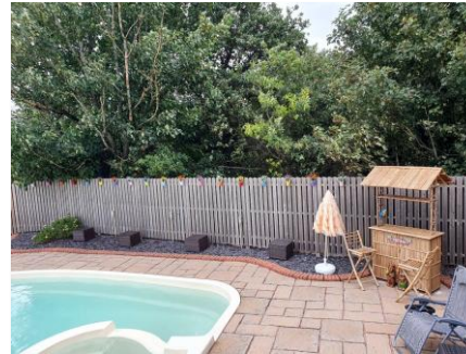
The pool is completely private, and offers a Polynesian-themed Tiki bar