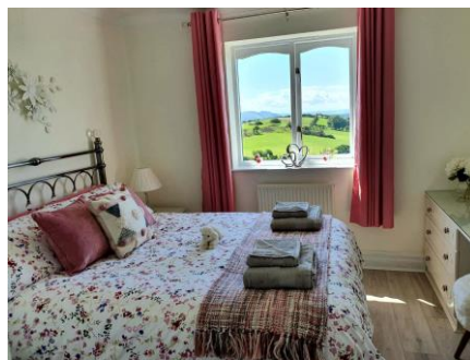
Bedroom 3 has a double bed