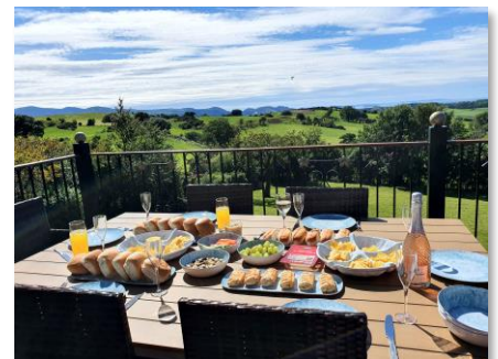
Dine on the huge balcony, with two 6-seater tables and stunning views