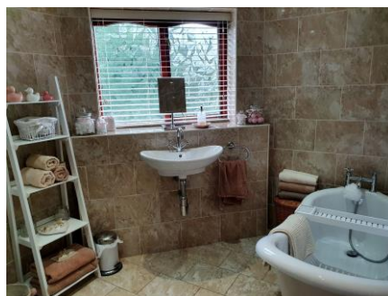
Family bathroom with roll top bath

Please note we do not accept stag or hen parties. Our house is ideal for extended family groups of varied ages but is not suitable for large numbers of singles. We strictly enforce the limit of 12 guests at the property at any time, day or night. *The heated pool is only available April to end of September