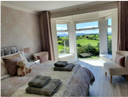
The master bedroom has floor-to-ceiling windows

The property has 5 bedrooms, 2 bathrooms (one en-suite), 2 cloakrooms with WC, large well equipped kitchen, dining room that seats 12 in comfort, living room, lovely conservatory with panoramic views, plenty of private parking for up to 6 vehicles, large lawns, patios and a huge decked balcony with stunning views. All bedrooms look out over the magnificent countryside, with distant sea views. The master bedroom is particularly impressive with floor-to-ceiling windows, massive marble-floored dressing room and a double-sized bath from which you can indulge yourself by watching our large integrated bathroom TV with Netflix.