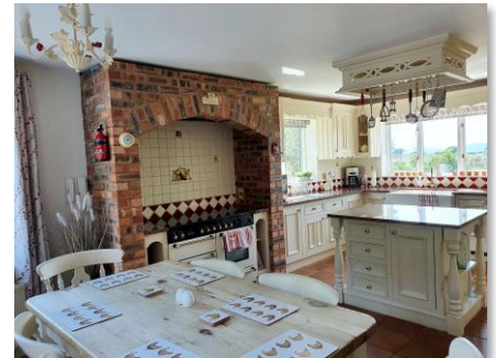
The large kitchen with granite worktops allows you to cater for all guests, with additional seating for 6