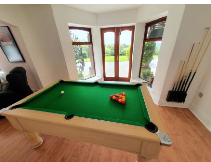
There is lots to entertain all ages, including our pool table shown here, plus table tennis, darts and Xbox