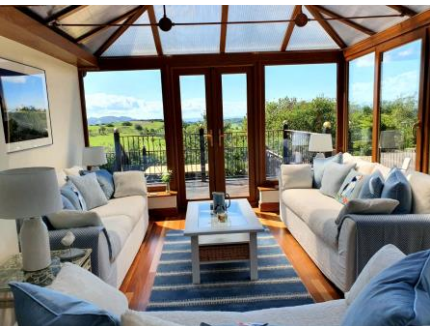
The conservatory has extra comfy seating, with panoramic views