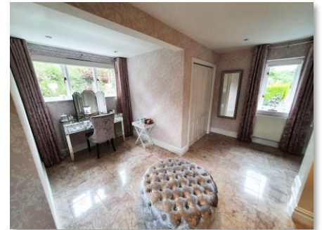
The master en-suite also leads to a large marble-floored dressing room