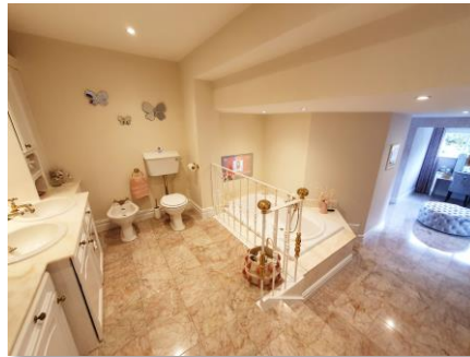
The master en-suite has a sunken double-sized bath and TV with Netflix