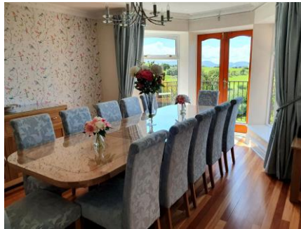
Our dining table seats 12 in comfort, again with fabulous views and double doors to the decked balcony