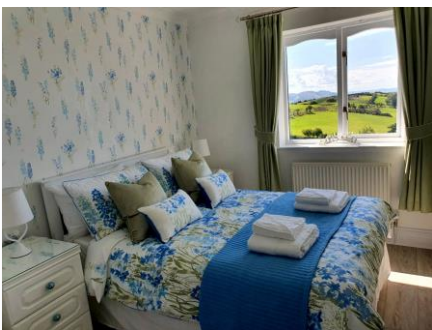
Bedroom 2 has a double bed