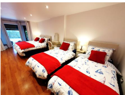
Bedroom 5 has either 1 x super king plus 2 singles (as here), or 4 single beds