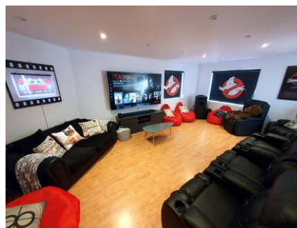
Our cinema room has a huge 86-in TV, with Sky Cinema and Netflix, seats 12 including 6 powered fully reclining cinema chairs