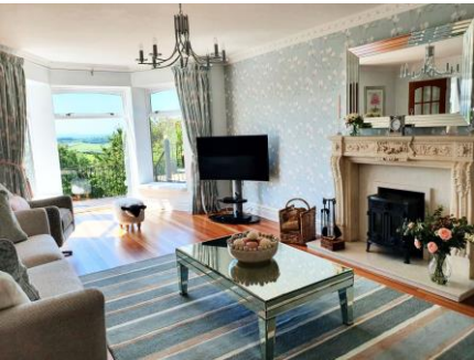
Our spacious living room offers fabulous views from its floor-to-ceiling window

Nestled within large enclosed grounds of approximately 1 acre, Cedar Lodge provides a private peaceful country retreat. Located just 2 miles from the A55 and the coast, it is an ideal base for exploring North Wales. In a delightful elevated setting, this luxury detached property is designed to take full advantage of uninterrupted views over open countryside to the Carneddau mountain range (part of Snowdonia), stretching out to the coast with Puffin island and the Isle of Anglesey taking centre stage, reaching as far as The Great Orme and Little Orme in Llandudno.