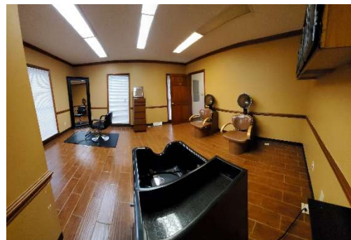
Typical Salon Suite