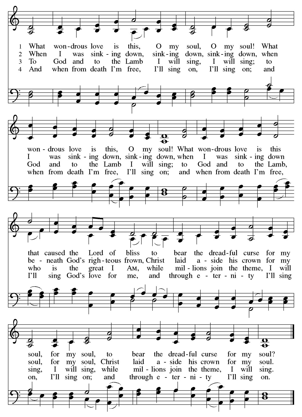
What Wondrous Love Is This