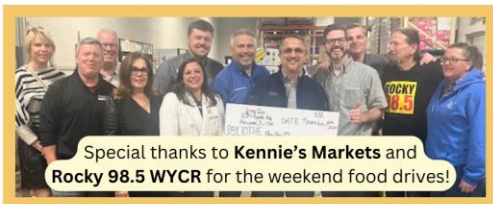
Special thanks to Kennie's Markets and Rocky 98.5 WYCR for the weekend food drives!

Thank you to the 2024 sponsors: Hanover Foods & UPMC