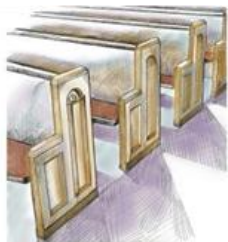
Perspective from the Pews

As you look at the Christmas Trees that decorate our Altar space, they look a little different than the ones in your home or at the stores in the Mall. There are no bells, balls, or ribbons, only white and gold ornaments. These ornaments are called “Chrismon’s”