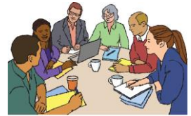
Church Council Retreat

As is our custom, we hold a council retreat early in the calendar year to exchange ideas and strategies that can be worked on.