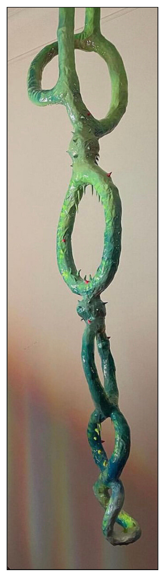
Gravitospore Helixanima - Liquid Lumina Resin, acrylic, epoxy, paper clay 84" x 16" x 8" inquire for purchase options