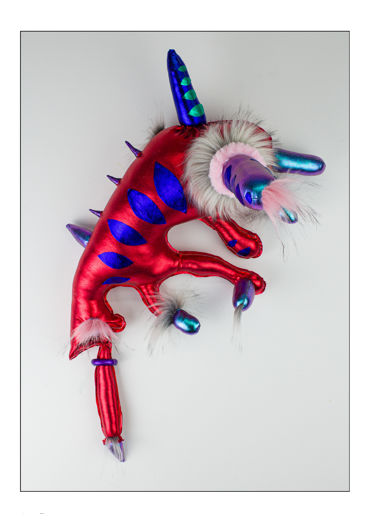
AstroRex Fabric, poly-fil, faux fur, acrylic, epoxy 22" x 12" x 12" $420