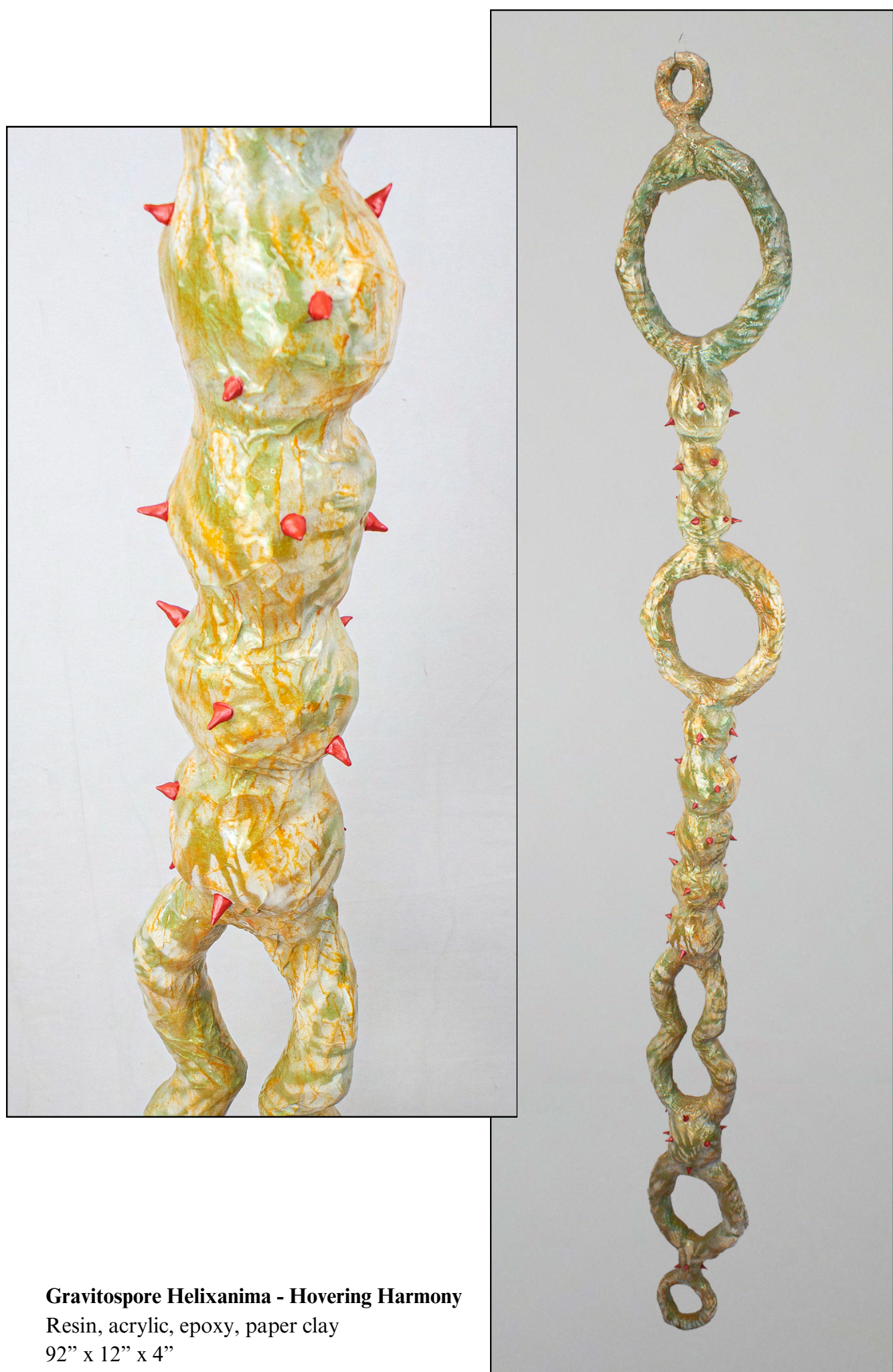
inquire for purchase options