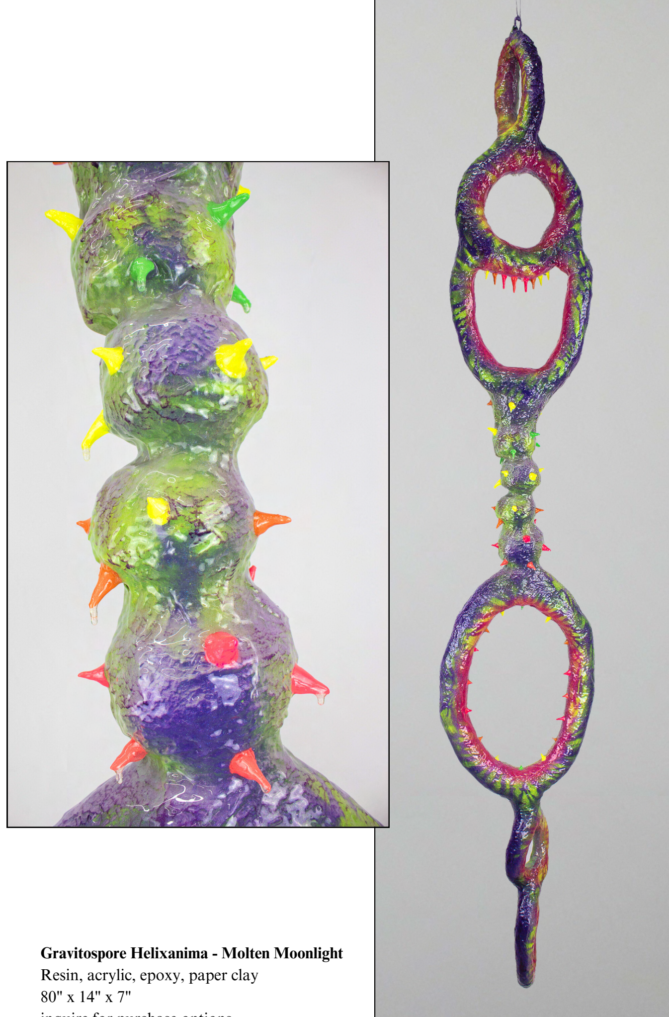
inquire for purchase options