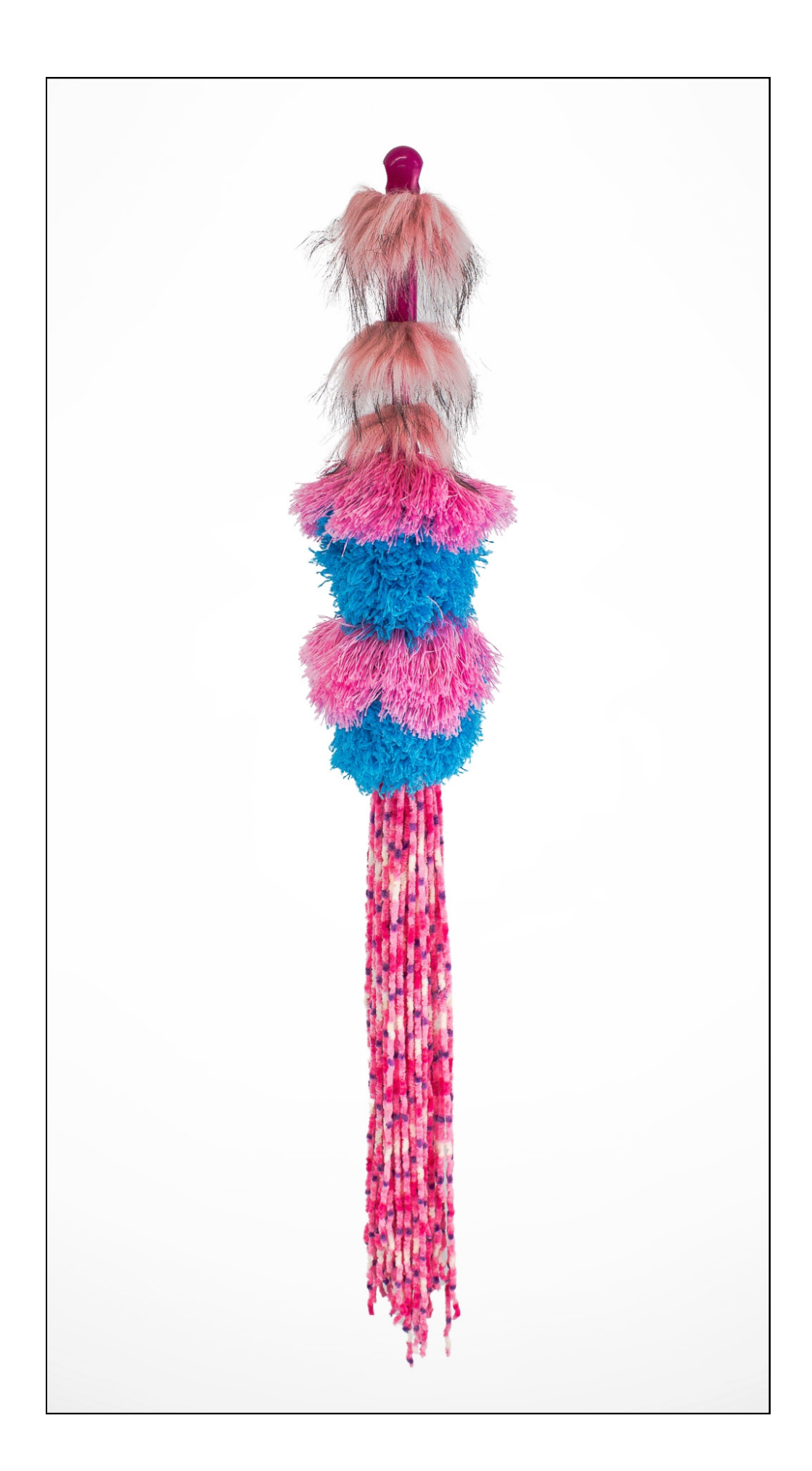
JellyFlutter - Dreamweaver Yarn, faux fur, fuzzy duster 40" x 5" x 5" $140