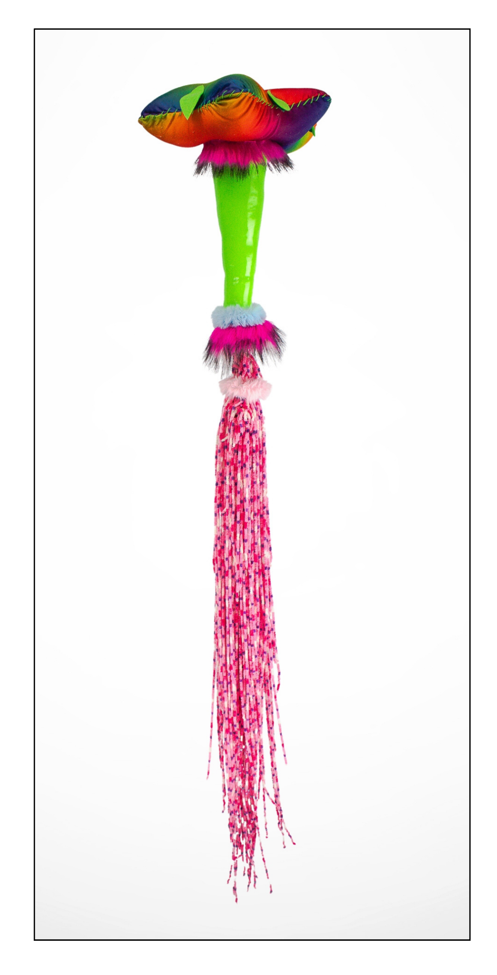
JellyFlutter -Lucid in a Liminal Trance Yarn, faux fur, fabric, poly-fill, yarn 70" x 12" x 12" $180