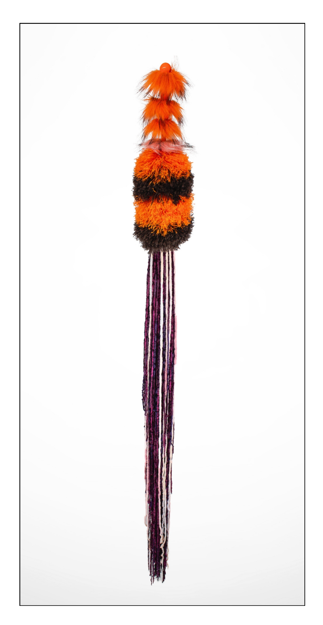
JellyFlutter - Dark Night of The Soul Yarn, faux fur, fuzzy duster 76" x 5" x 5" $140