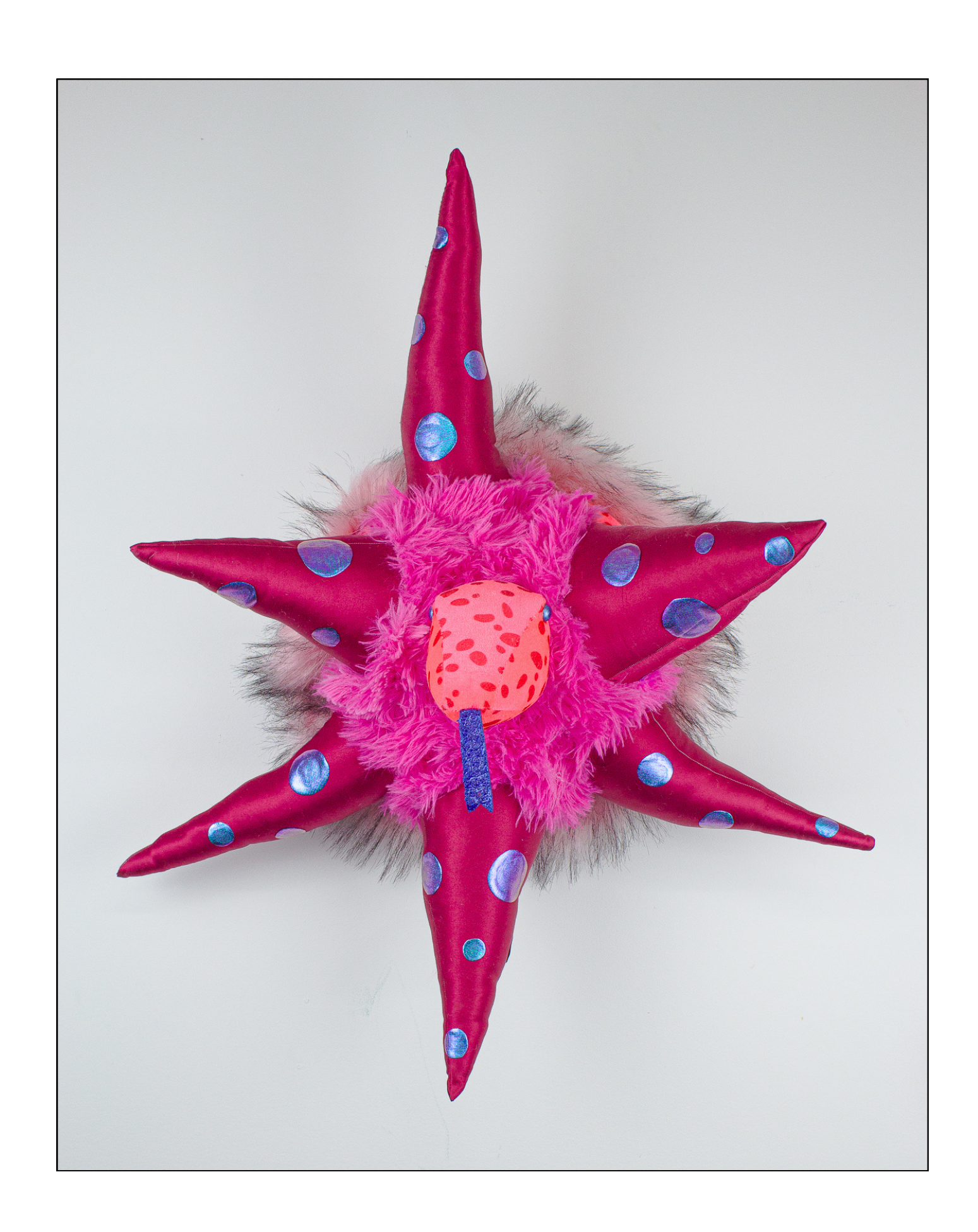
Echos of Eden Fabric, poly-fil, faux fur, faux hair, acrylic 32" x 12" x 23" $420