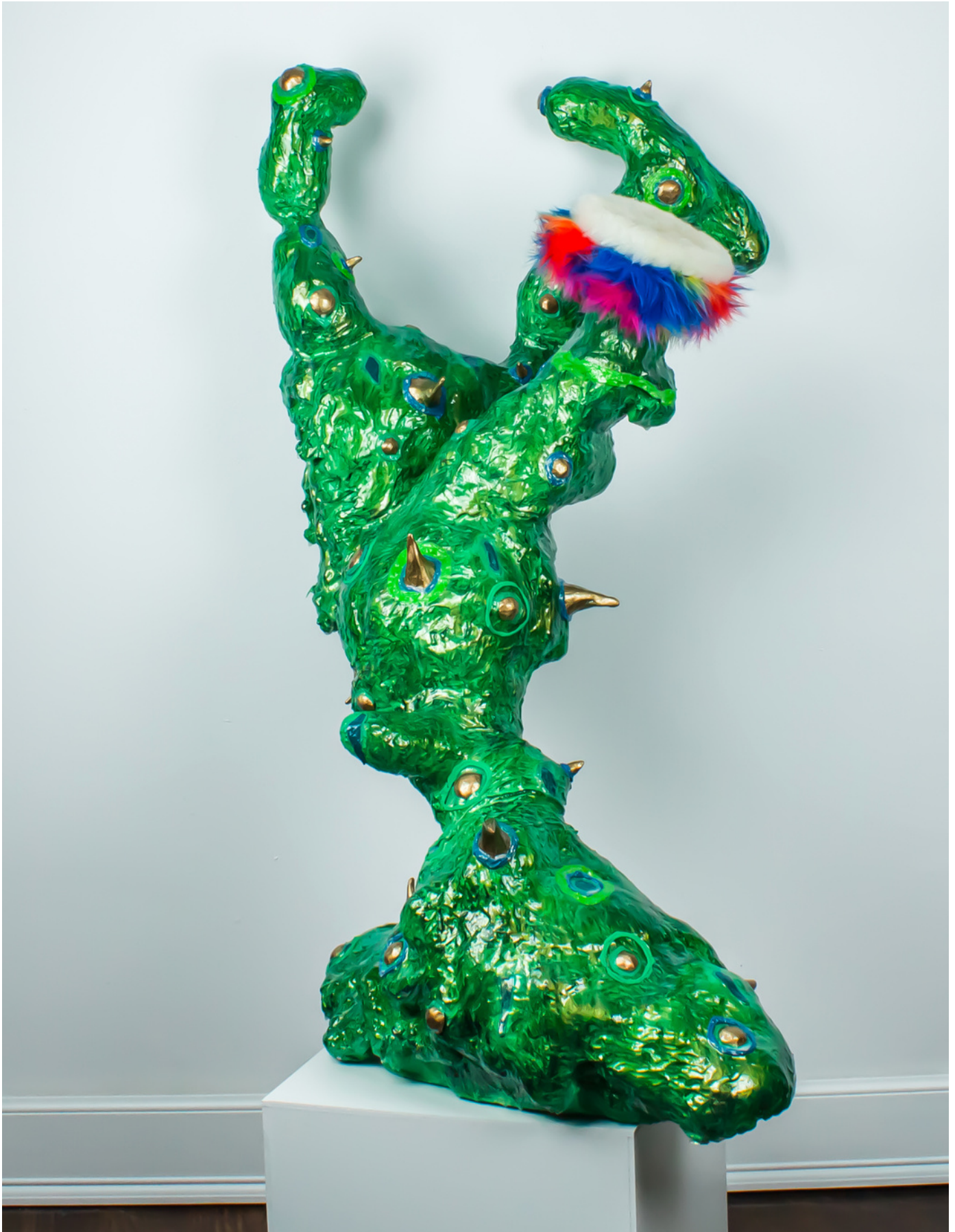
Universal Transmitter, 2022

Acrylic, gypsum, clay, texture paste, iridescent epoxy resin, faux fur