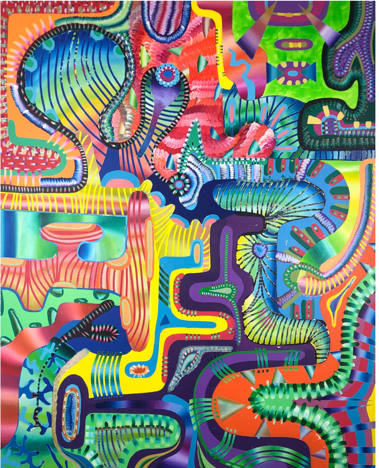
Right in Front of You , 2021 Acrylic, 60" x 48"