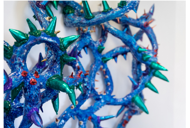
The Thing , 2022

Acrylic, gypsum, papier mache, texture paste, clay, fabric, poly-fill, iridescent epoxy resin