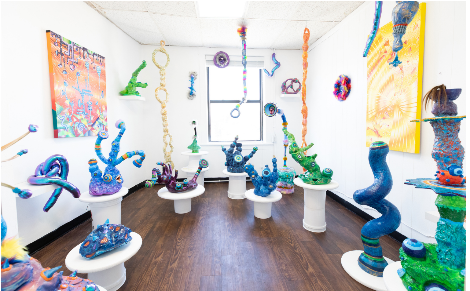
Plants Talk (just listen), 2022 Installation at Organic Intelligence