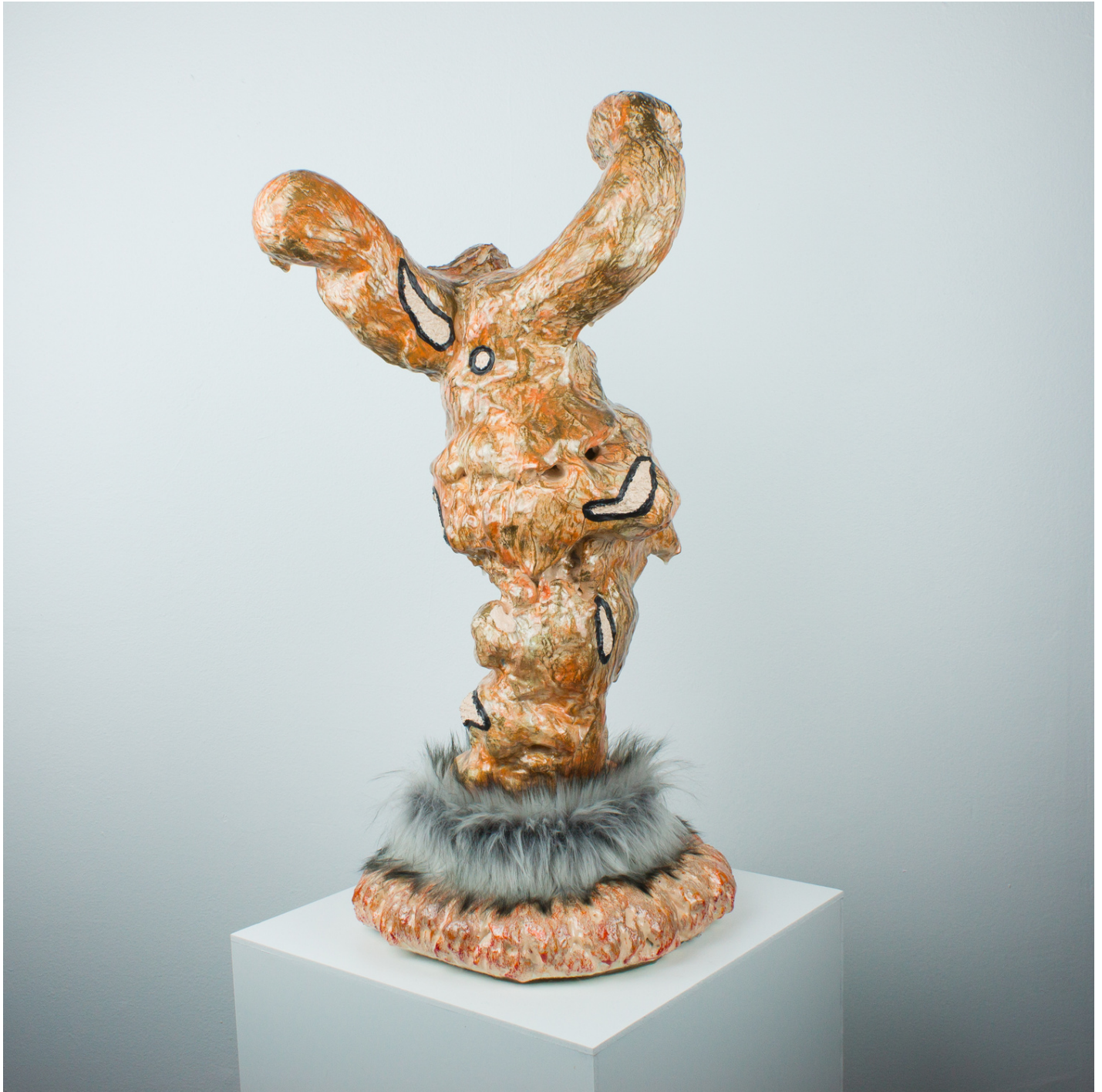
Out Past Dark , 2021

Acrylic, gypsum, papier mache, foam, texture paste, faux fur