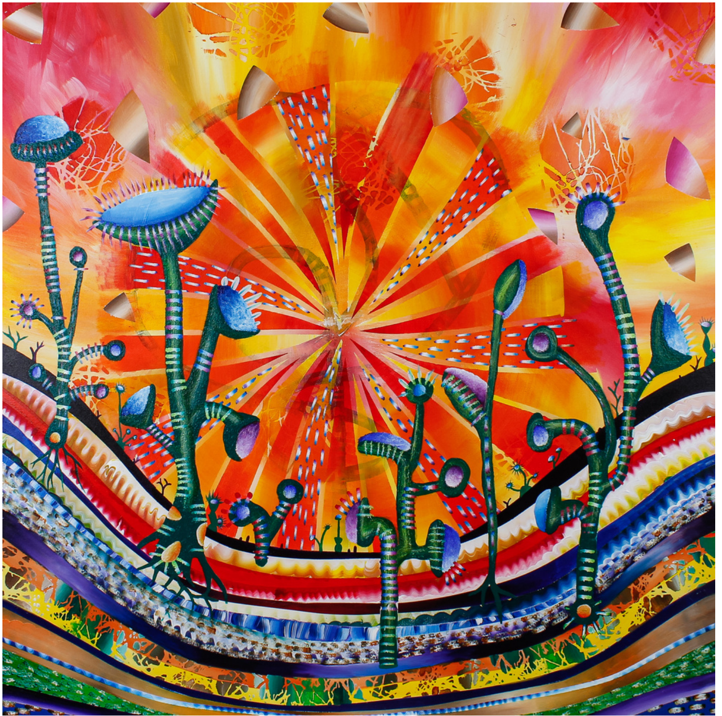
Hyperbolic Tone (Plants at The Disco), 2021