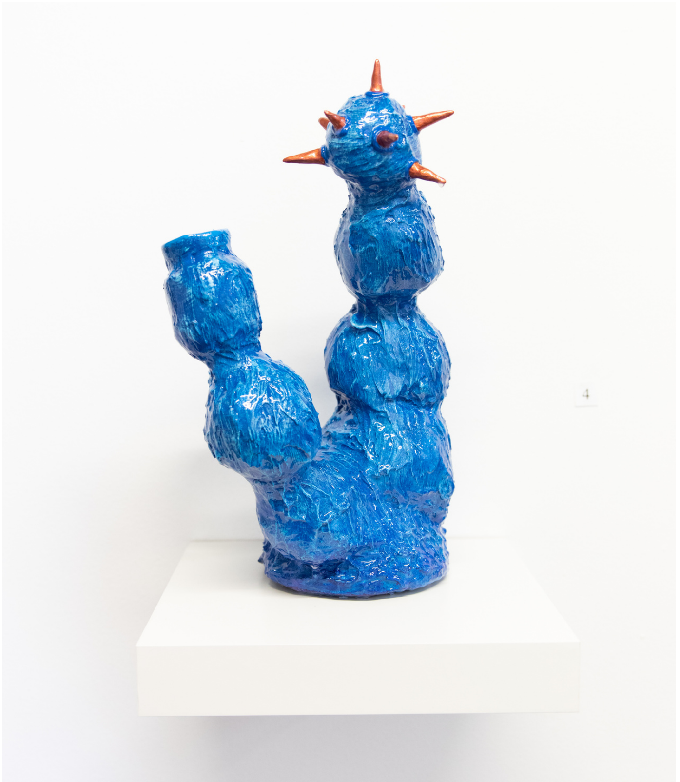
Survival of The Strangest , 2022

Acrylic, gypsum, papier mache, clay, iridescent epoxy resin