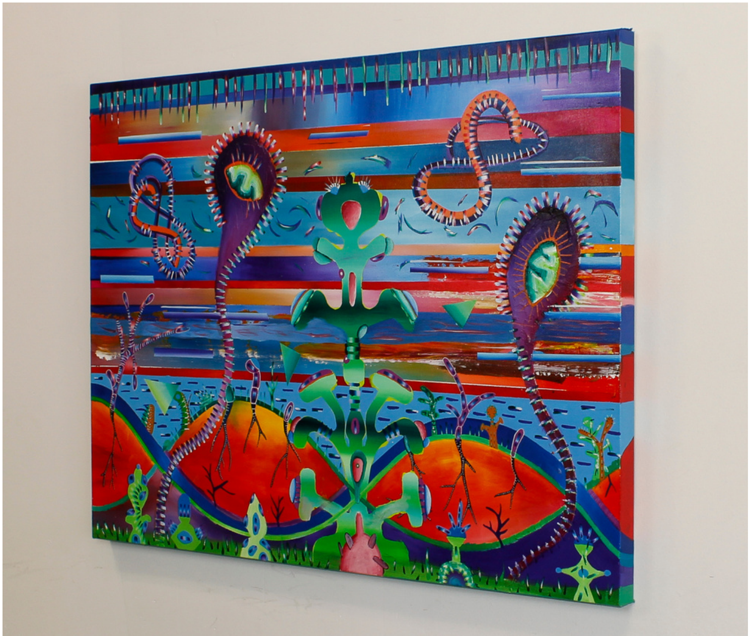
Awakening a Diety , 2020