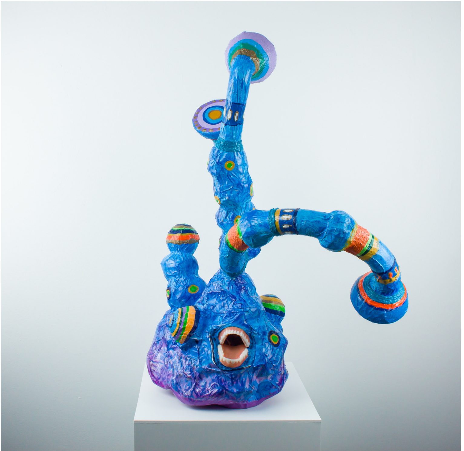
Feed Me, 2021

Acrylic, papier mache, texture paste, dentures