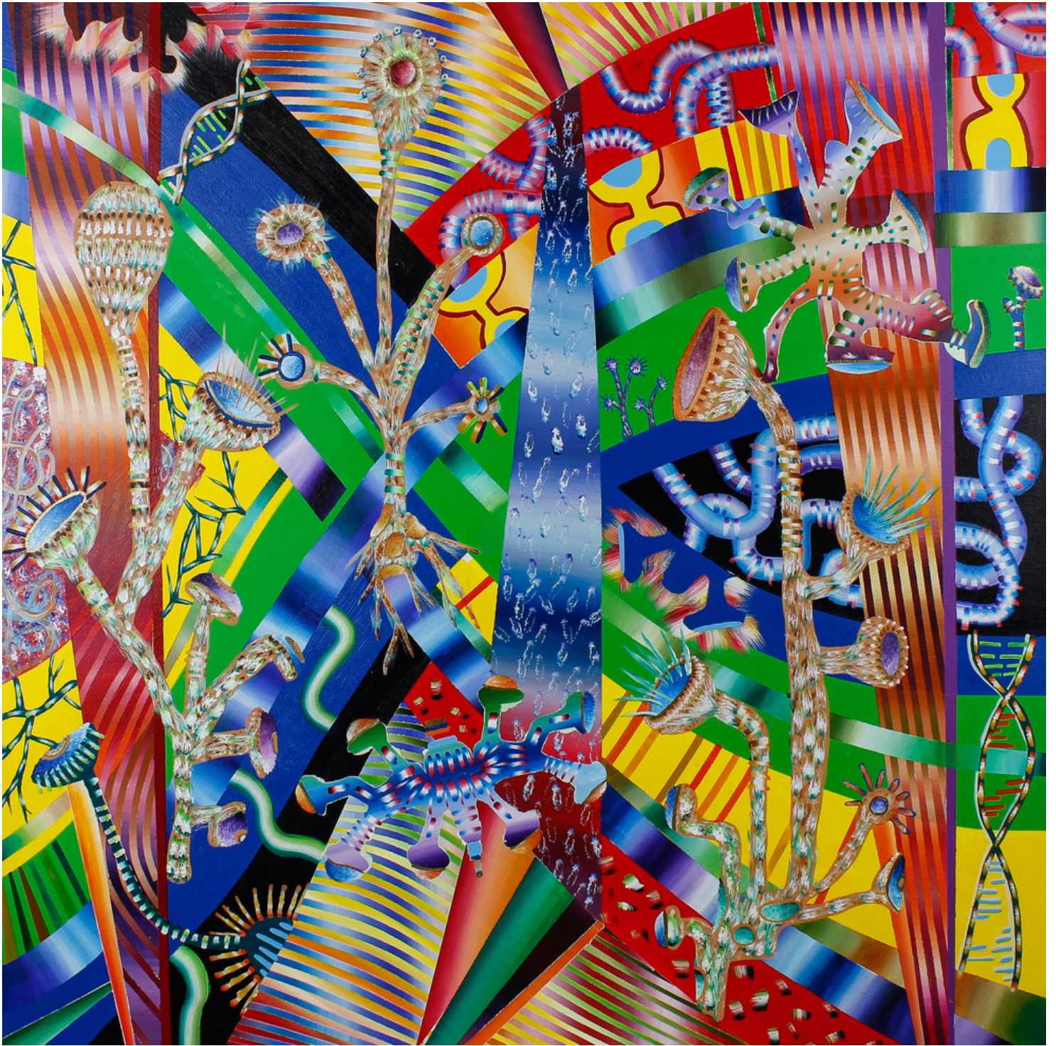
Microscopic Waves , 2021