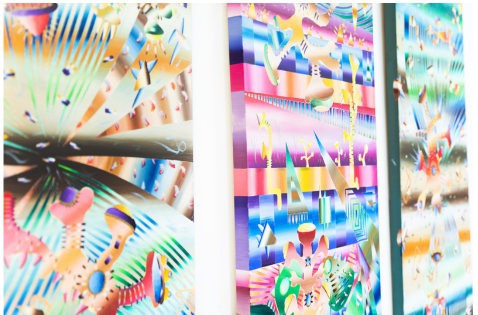
Trust in Us Embedded on The Sand, 2022 Acrylic, 48" x 24" (three panels)