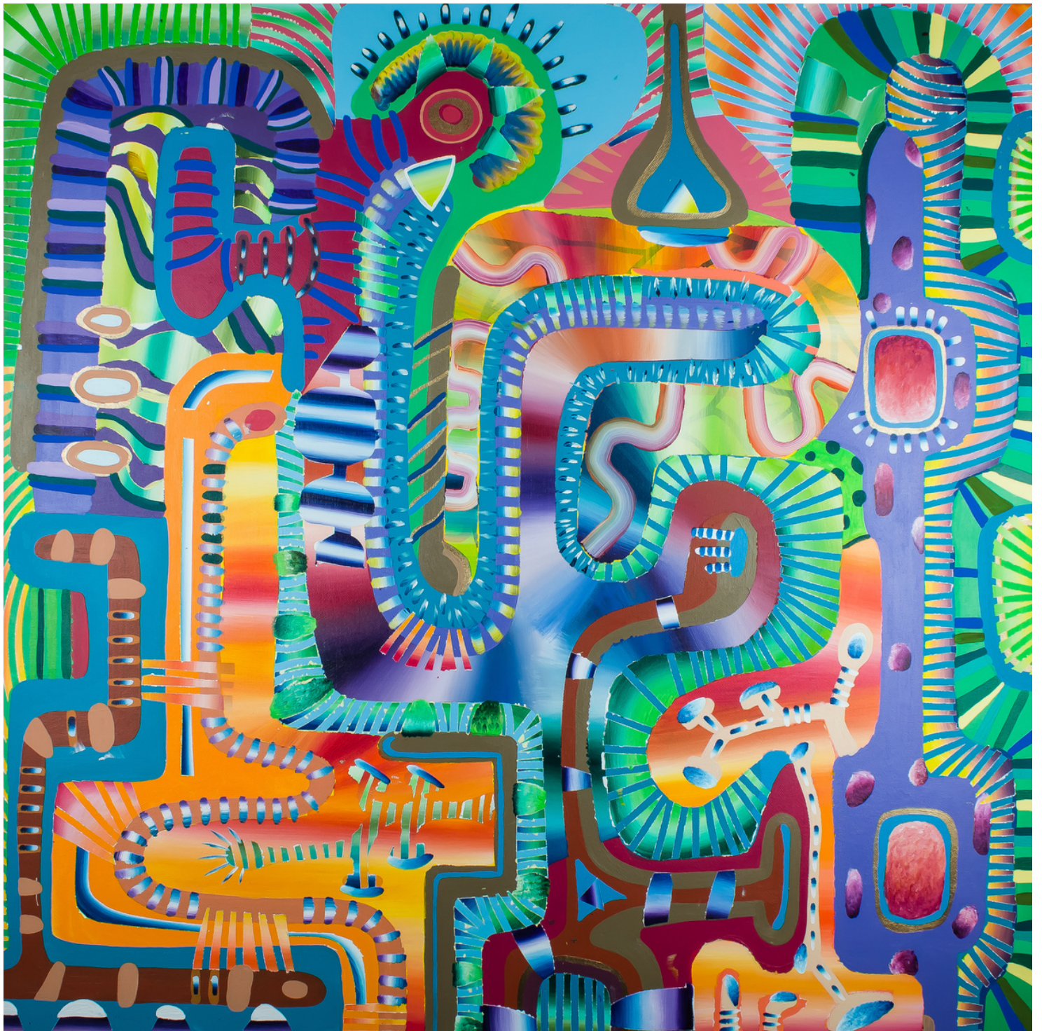
Polycrystalline , 2021