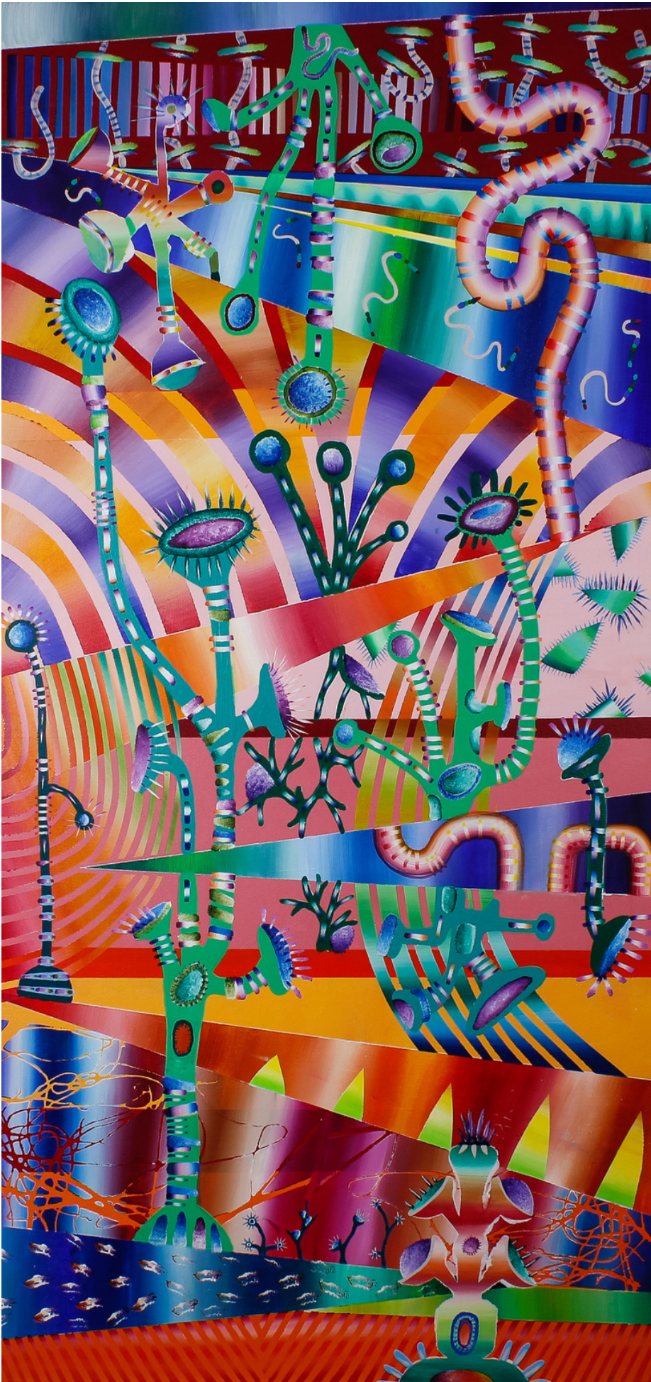
They Took Me on a Helicopter Ride, 2021 Acrylic, 48" x 24"