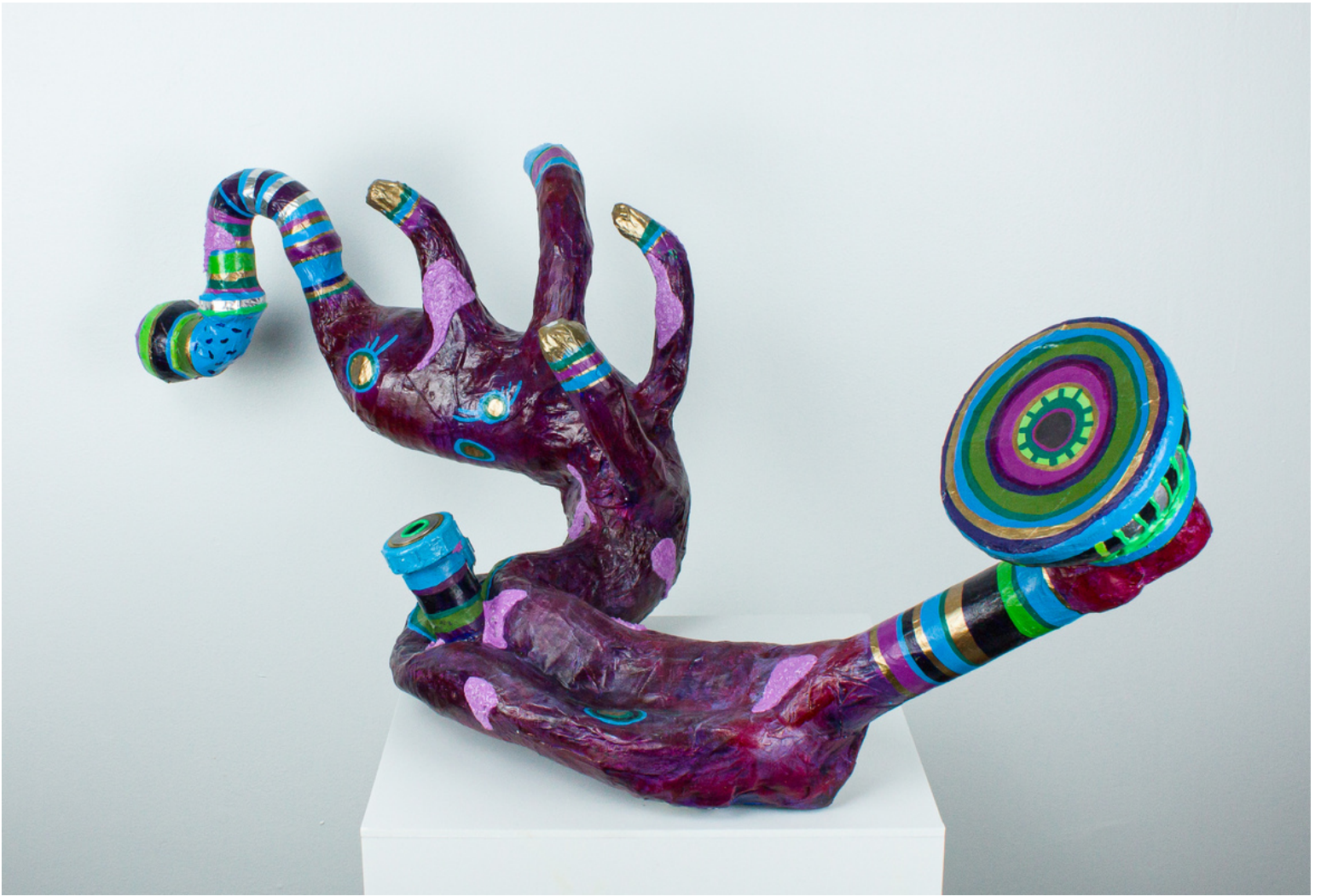
Telescopic , 2021 Acrylic, papier mache, PVC, metal texture paste