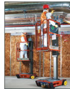
3. 11' WORKING HEIGHT IN 11 SECONDS