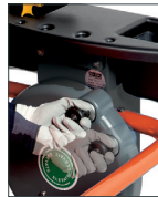
2. TURN THE HANDLE