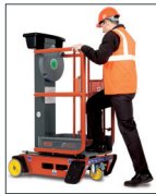
1. STEP IN

BATTERY FREE POWER FREE OIL FREE EASY! FAST! SAFE! AWARD WINNING