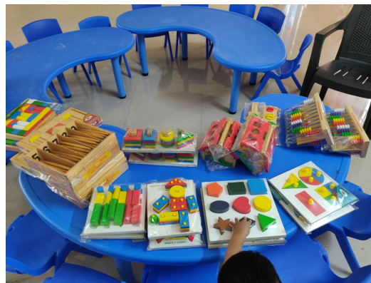
Wooden learning toys donated by Srilatha.