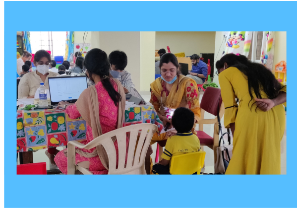
Pediatricians busy working at the camp.