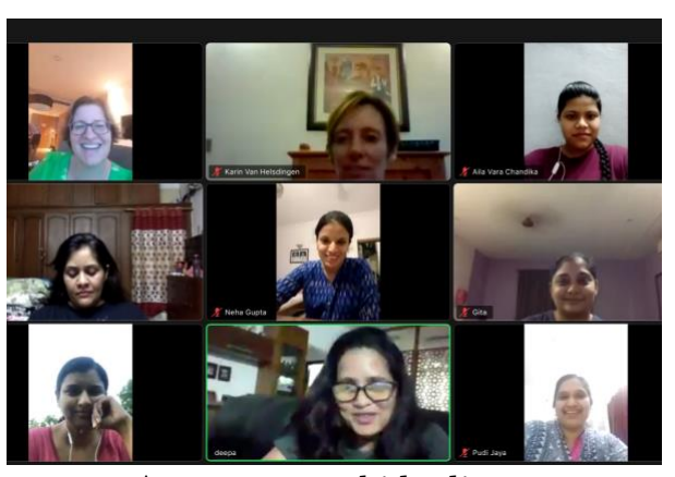
A new way to bid adieu....