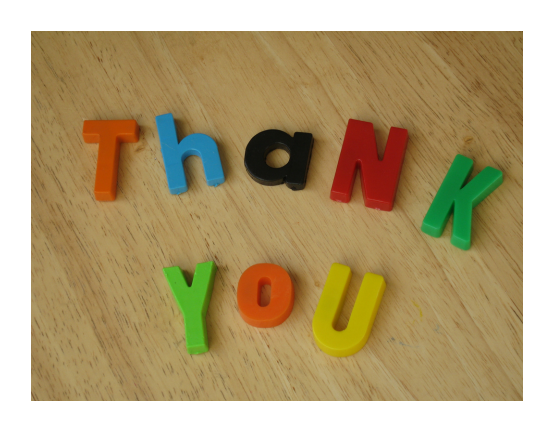
Donations in Kind

Image courtesy and further information: https://en.wikipedia.org/wiki/Spina bifida