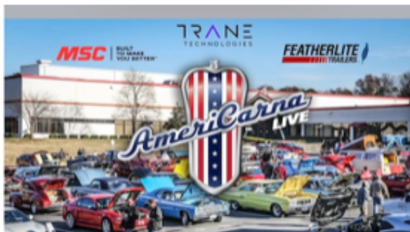
Nov 22 AmeriCarna LIVE Car Show 2025