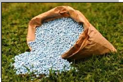
Agro – Chemicals