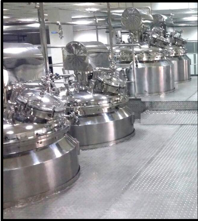
SHAMPOO/OIL/HAND WASH SECTION