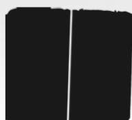
ALMANAC Benjamin Banneker 1791