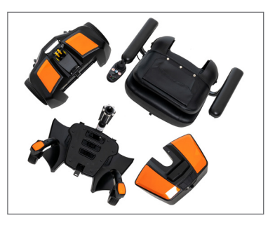
Go Chair<sup>®</sup> disassembly

Most Go-Go<sup>®</sup> Travel Mobility and Pride<sup>®</sup> mid-size scooters feature Feather-Touch —one-hand disassembly for hassle-free transport and storage.