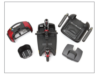
Scooter/travel mobility disassembly