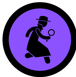
The Science Behind...