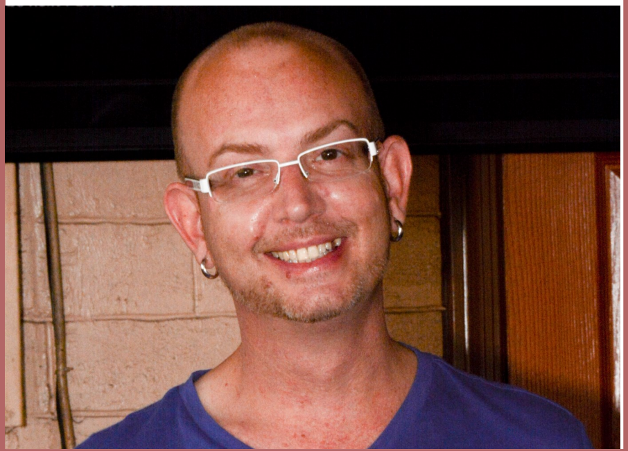
Pictured above: Carl Perkins