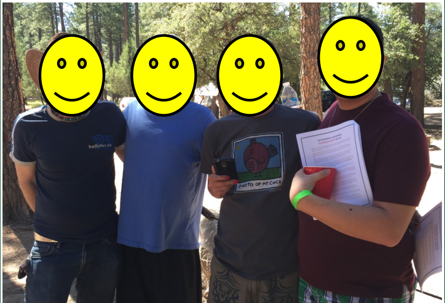
Pictured above: Could be you...all you have to do is sign up for campout!