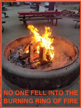
NO ONE FELL INTO THE BURNING RING OF FIRE