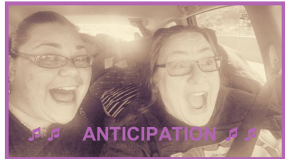
♪♪ ANTICIPATION ♪♪