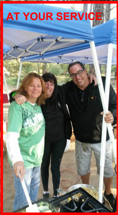
AT YOUR SERVICE