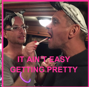
IT AIN'T EASY GETTING PRETTY