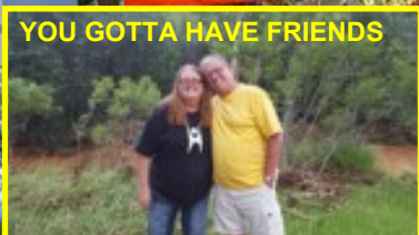
YOU GOTTA HAVE FRIENDS