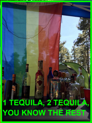
1 TEQUILA, 2 TEQUILA, YOU KNOW THE REST