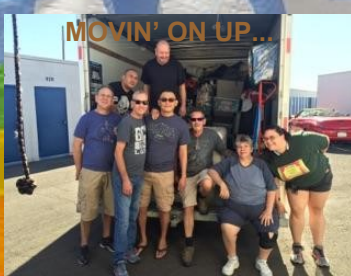
MOVIN' ON UP...