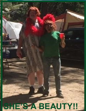
SHE'S A BEAUTY!!