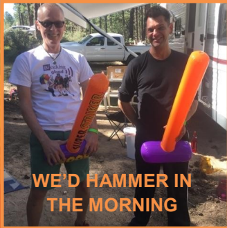
WE'D HAMMER IN THE MORNING