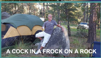
A COCK IN A FROCK ON A ROCK