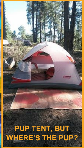
PUP TENT, BUT WHERE'S THE PUP?