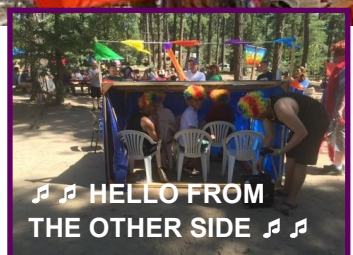
♪♪ HELLO FROM THE OTHER SIDE ♪♪