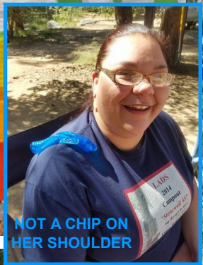
NOT A CHIP ON HER SHOULDER