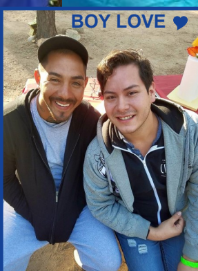
BOY LOVE ♡