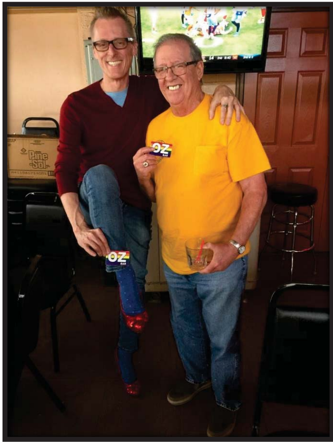
January Challenge Winners