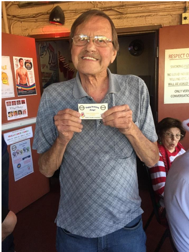
December Birthday Dan Brown