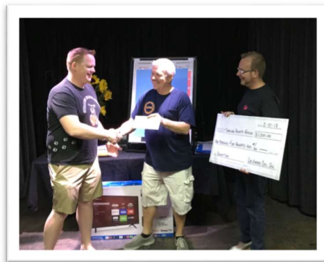
Stealing Hearts receiving charity check