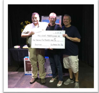
Mulligan's Manor receiving charity check