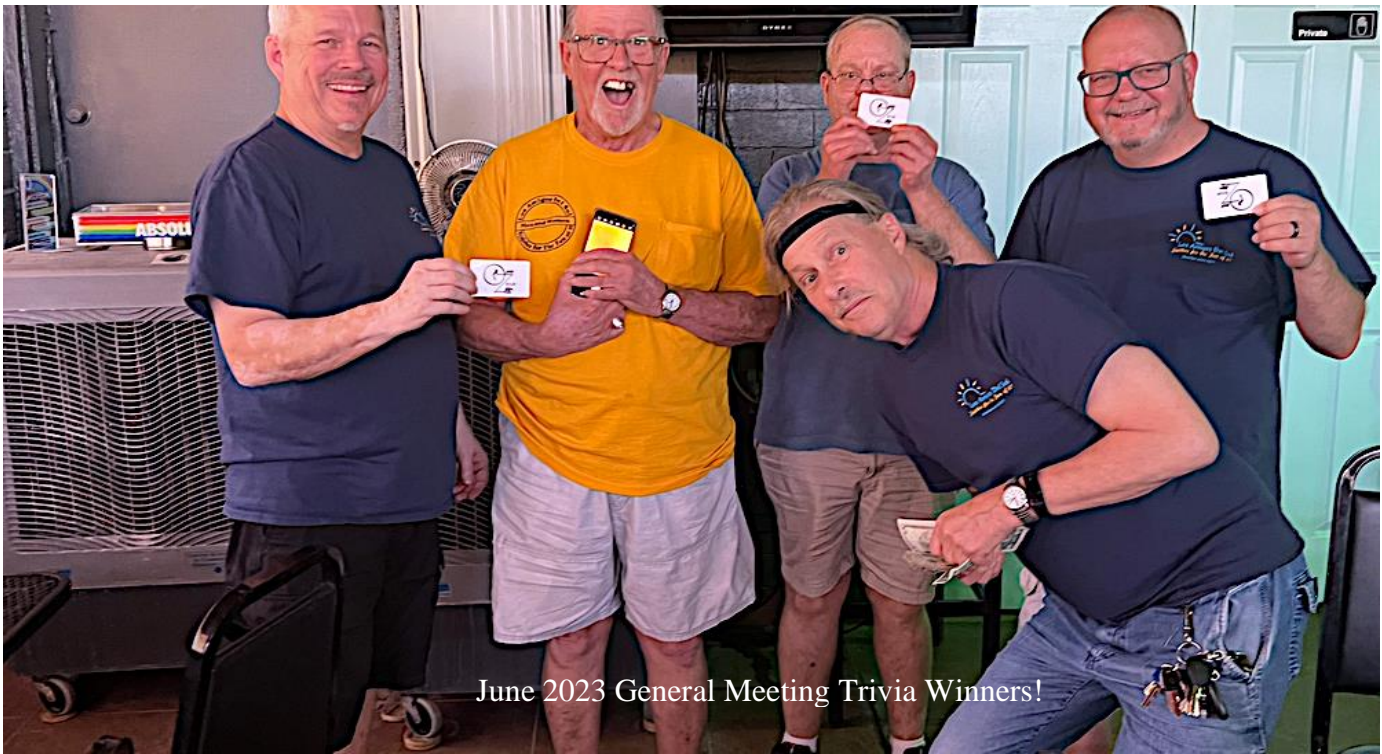
June 2023 General Meeting Trivia Winners!