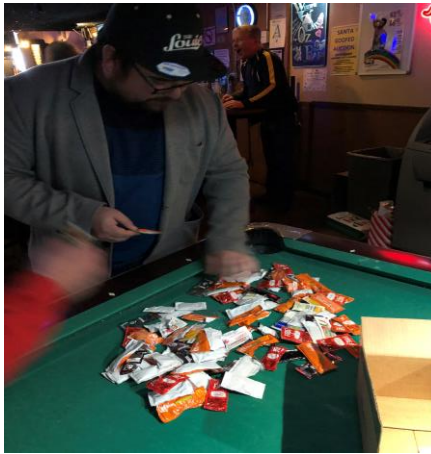
Santa really goofed