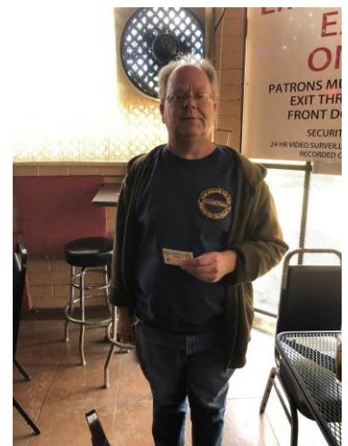
January Birthday Boy

If you are out and about, send your photo to ladsphez@gmail.com . We'll put it in our next newsletter.