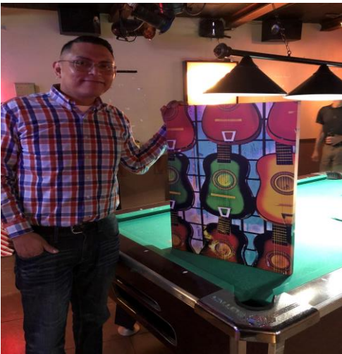
Huge win for the Santa believer