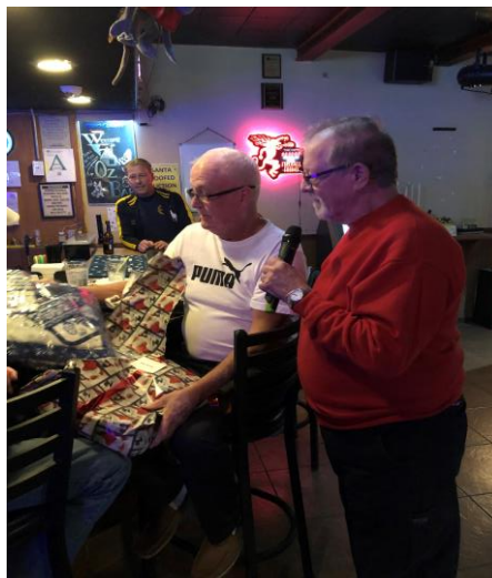
Santa didn't goof