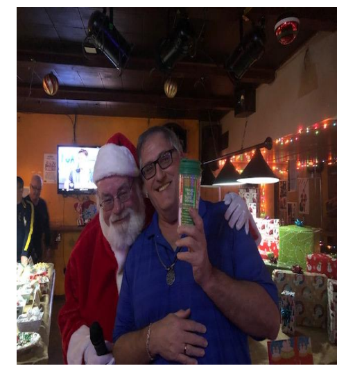
Santa's Gift Give-Away