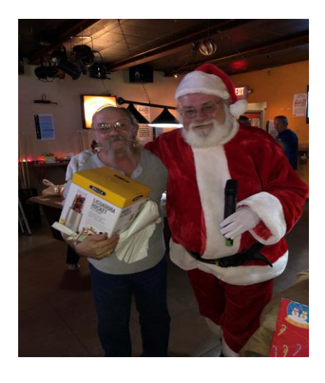
Santa's Gift Give-Away

If you are out and about, send your photo to <u>ladsphxaz@gmail.com</u>. We'll put it in our next newsletter.