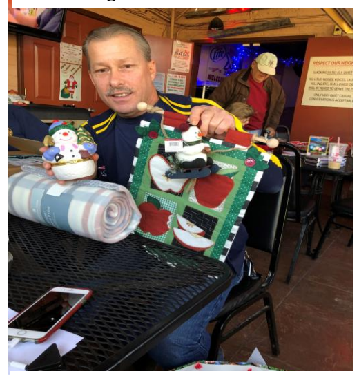
LADS Gift Exchange