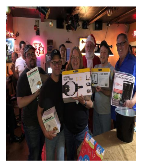
Santa's Gift Give-Away