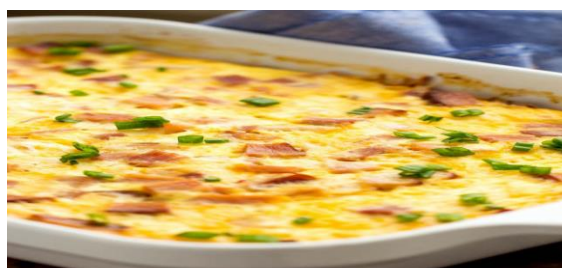
Compliments of Fran Ahler

Soften tortilla pieces in butter. Lay in 9x13 pan. Layer eggs over tortillas, then rotel, onion. Dollop sourcream. Add cheese. Bake at 350° for 10 min.