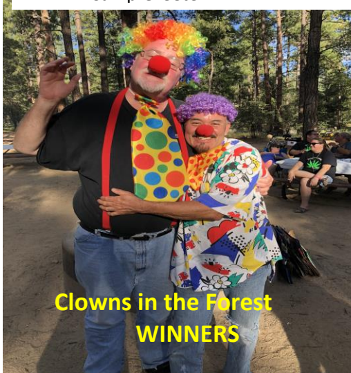
Clowns in the Forest WINNERS