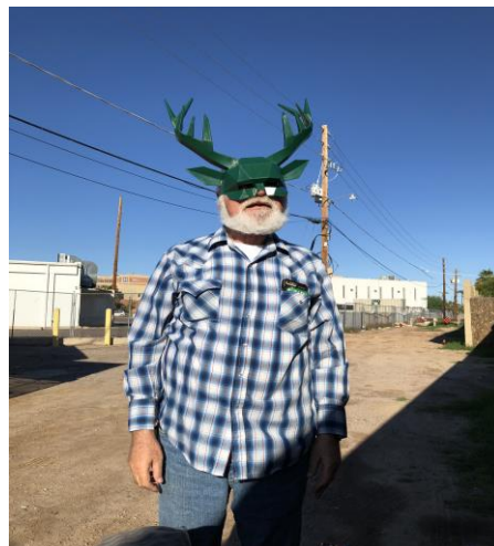
Santa looking for his deer