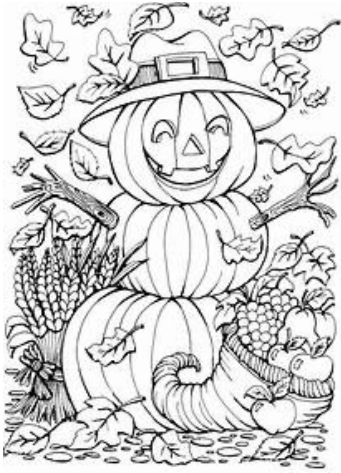
Color Me!! Top 3 win A Drink on Me! (Corey)