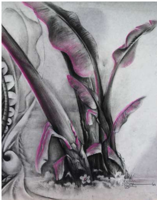
Muramba nja- by Wama Njuguna 46x58cm 115usd each