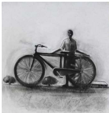
A Beast On Wheels- by Jimmy Kitheka 86x91cm 550 usd