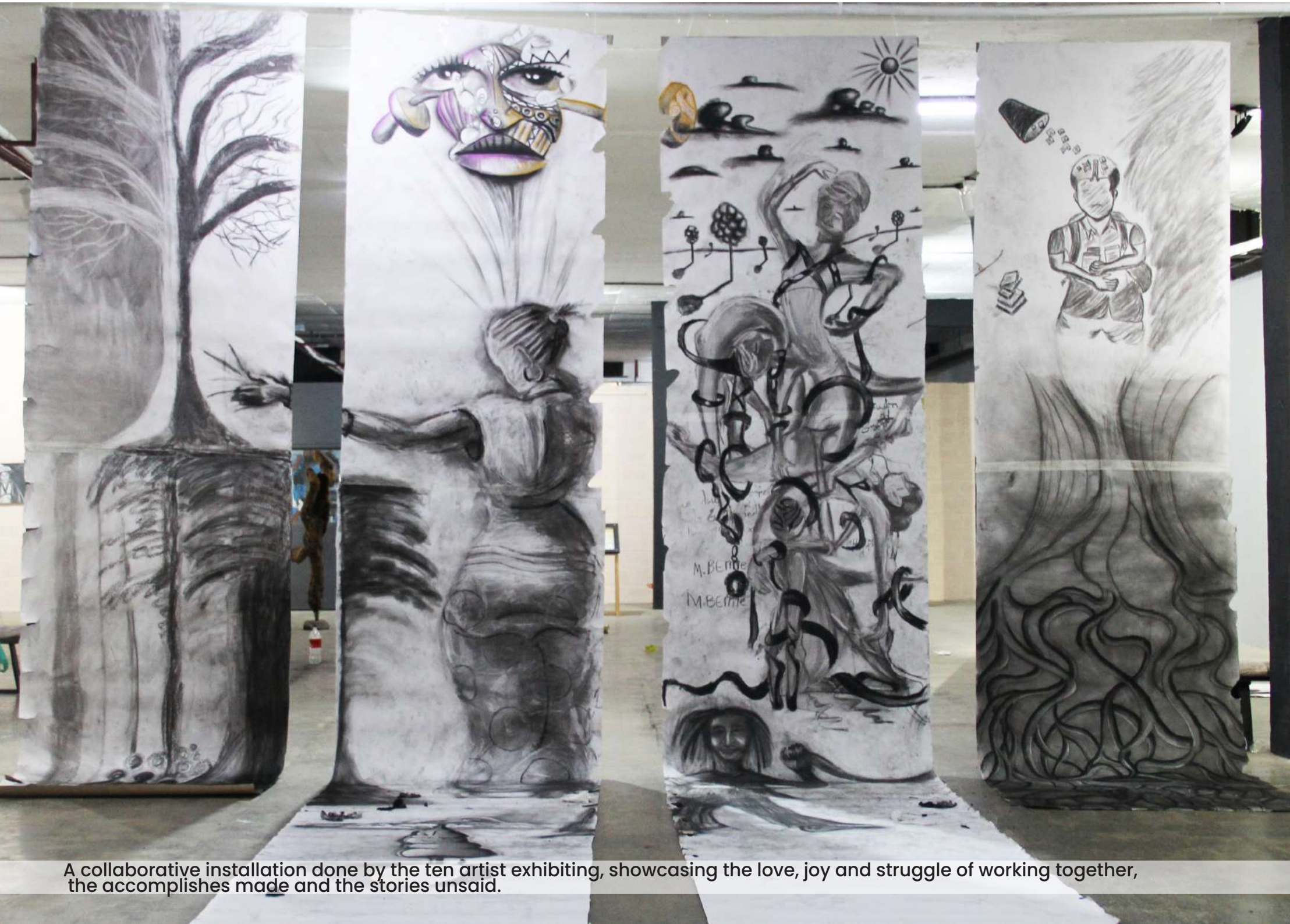
A collaborative installation done by the ten artist exhibiting, showcasing the love, joy and struggle of working together, the accomplishments made and the stories unsaid.