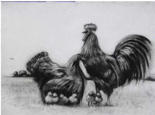
Hawk vs Peckers- by Jimmy Kitheka 82x50cm 400 usd