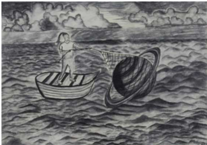
Fisher girl- by TAMILINUS ANU 100x70cm 155usd