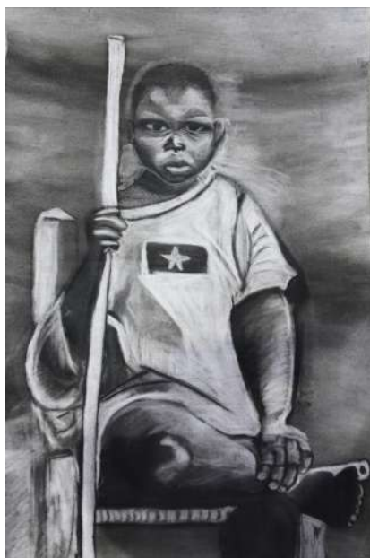
Banyoro King- by Ruth Muthoni 53x87cm 200usd