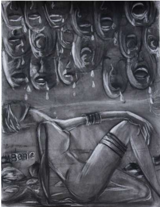
Acid Rain- by Benardette Moraa 76x100cm 155usd