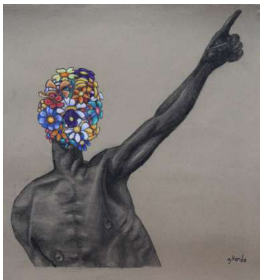
The only way is up- by Gavin Kendo 57x 55cm 150usd