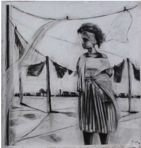
Jua La Mvua- by Jimmy Kitheka 82cm by 87cm 500 usd