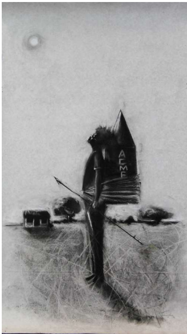
Dream Catcher (ACME)- by Jimmy Kitheka 50x90cm 300 usd