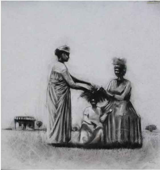
Hands of Heritage- by Jimmy Kitheka 86x91cm 500 usd