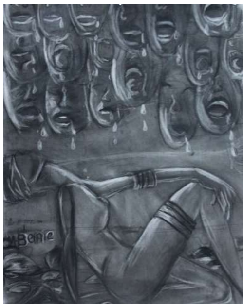
Prisoner of choice- by Benardette Moraa 90x120 cm 155usd