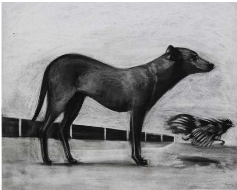
Guarded Pecker- by Jimmy Kitheka 75.5x93cm 550 usd