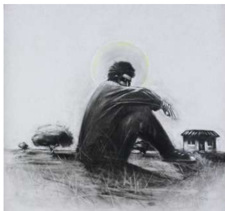
Misunderstood- by Jimmy Kitheka 86x91cm 550 usd