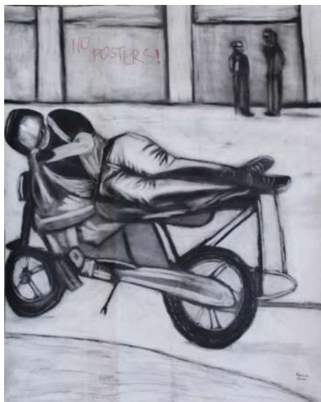
5 Min Away- by Wakisha Wazome 80cm by 65cm 193usd