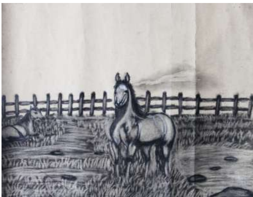
Horses- by Trevor 59x47cm 80usd