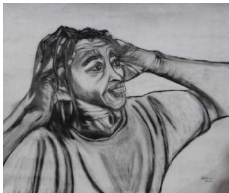
The Realization- by Wakisha Wazome 50cm by 60cm 140usd