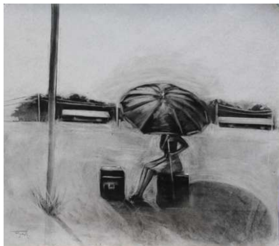
Sheltered Journey- by Jimmy Kitheka 86x91cm 350 usd