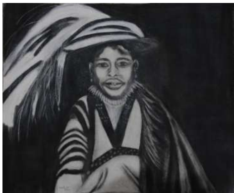
An Ode to Wanjiku- by Wakisha Wazome 50cm by 60cm 250usd