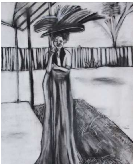
Sunday Best- by Wakisha Wazome 60cm by 50cm 140usd