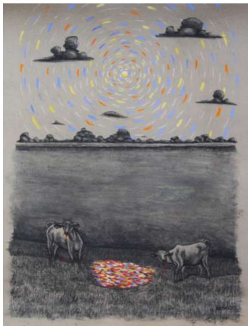
The Flower Eaters- by Gavin Kendo 75x 53cm 150usd