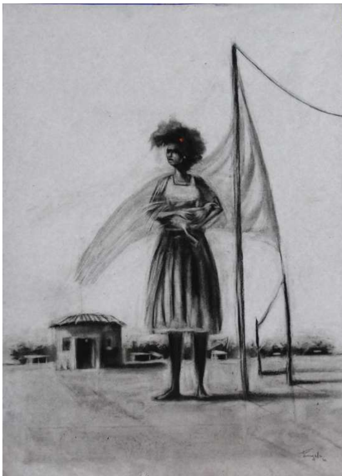
Beba Pecker- by Jimmy Kithaka 60x80cm 550 usd