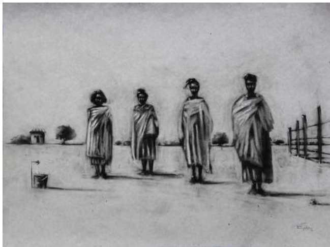
Daughters of Earth- by Jimmy Kitheka 81x60cm 550usd