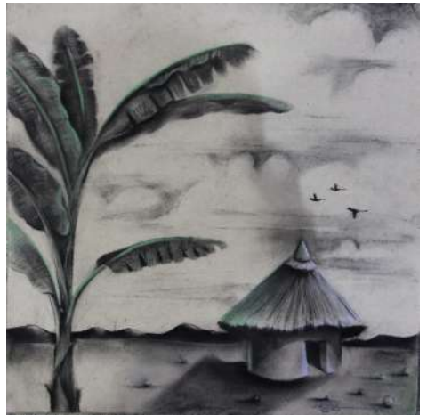
Muramba mucii- by Wama Njuguna 45x45cm 100usd each