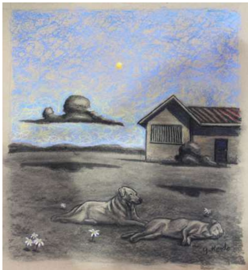
A lazy afternoon- by Gavin Kendo 52x48cm 150usd