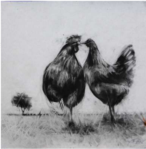
Courting Peckers- by Jimmy Kitheka 61x61cm 400 usd