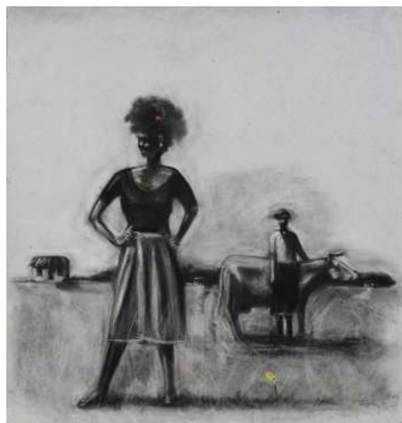
My Brothers Cow- by Jimmy Kitheka 86x91cm 550 usd