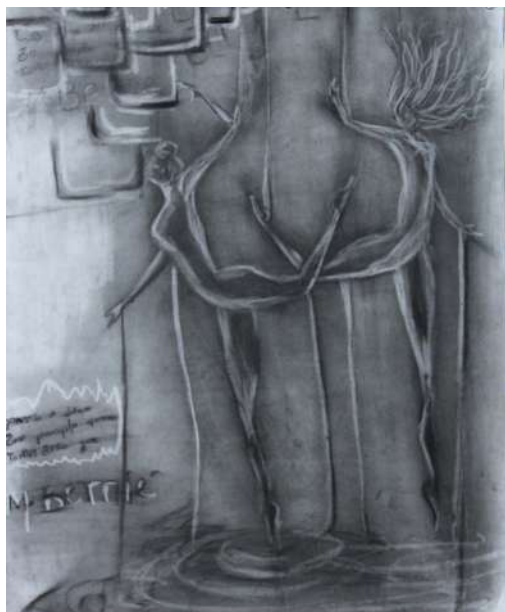
Life puppet master_ by Benardette Moraa 69x93cm 120usd