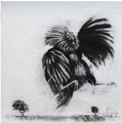
Fighting Pecker in Flight- by Jimmy Kitheka 61x61cm 400 usd