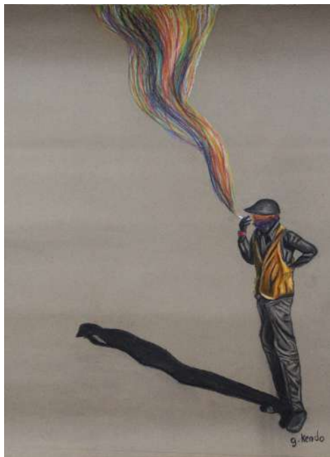
A blue collar day dream- by Gavin Kendo 73x63cm 150usd