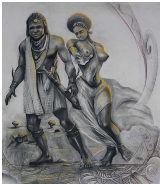
Divine essence- by Wama Njuguna 90x105cm 320usd