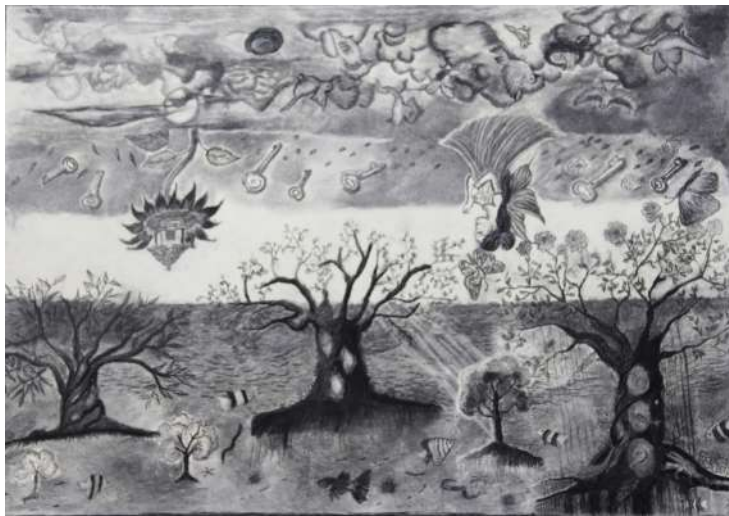
Dreamworld- by TAMILINUS ANU 100x70cm 155usd