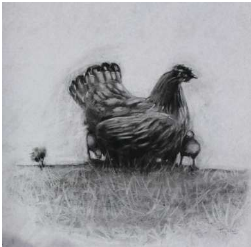
Shielded Peckers- by Jimmy Kitheka 61x61cm 400 usd