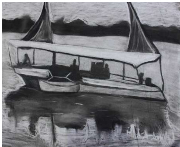
Lake Nakuru- by Ruth Muthoni 89x70 cm 155usd