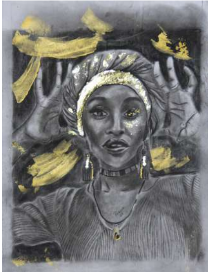
Golden Series 1,2 & 3- by Patricia Githae 29.7x42cm 200usd each