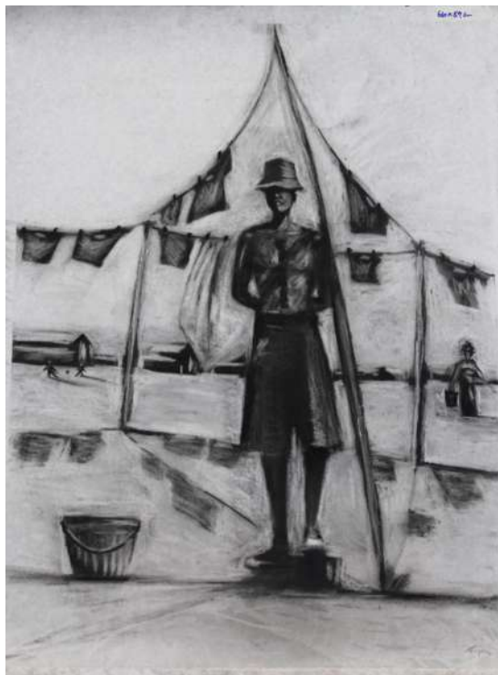
Wash and Wear- by Jimmy Kitheka 60x89cm 550 usd