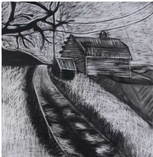
Later in Nakuru Village- by Ruth Muthoni 84x87cm 155 usd