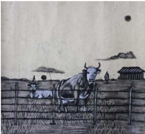
Cows in field- by Trevor 52x48cm 80usd