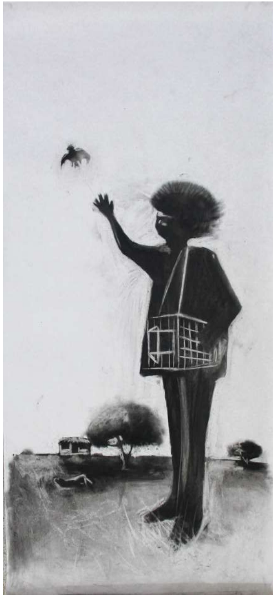
Free flyer- by Jimmy Kitheka 85x184cm 600 usd