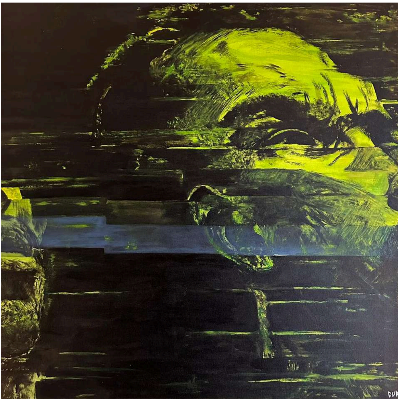
Title : THE GREEN LIGHT Medium : Acrylic on Canvas Size: 100cm x 100cm USD 2016

A visual meditation on purpose enacted, momentum embraced and progress made without declaration.