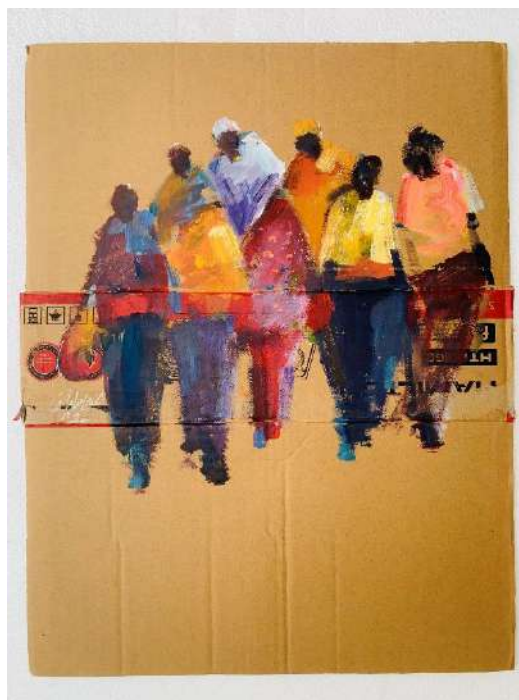
Faces Burned By Sun IV, 2024 Mixed media on Recycled Cartoon 35 x 30 cm