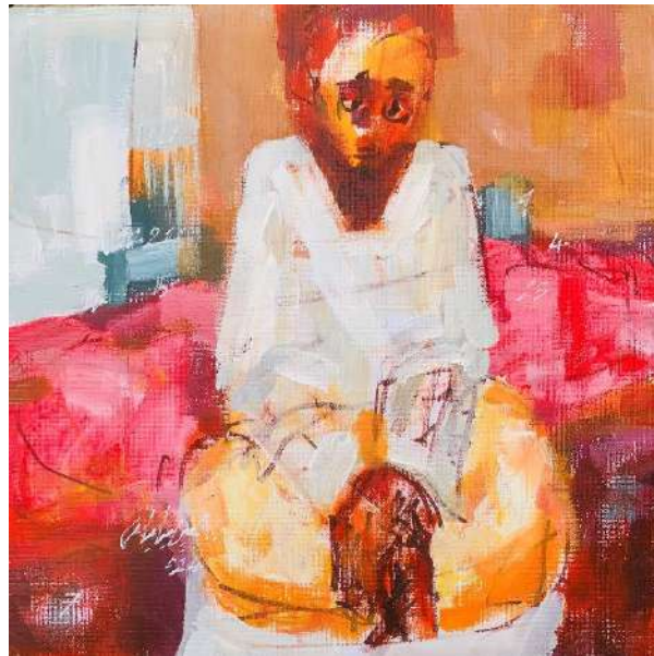
leaving the city IV , 2024 Mixed media on Canvas 30 x 30 cm