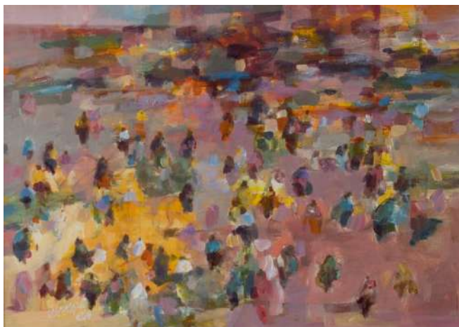
leaving the city IV, 2024 Mixed media on Canvas 99 x 130 cm