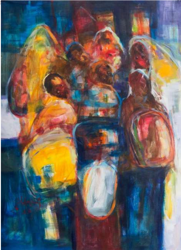
leaving the city V, 2024 Mixed media on Canvas 129 x 100 cm