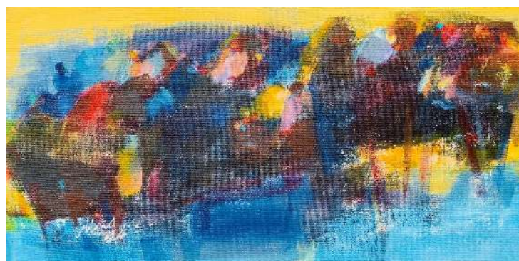
leaving the city III, 2024 Mixed media on Canvas 61x 30 cm