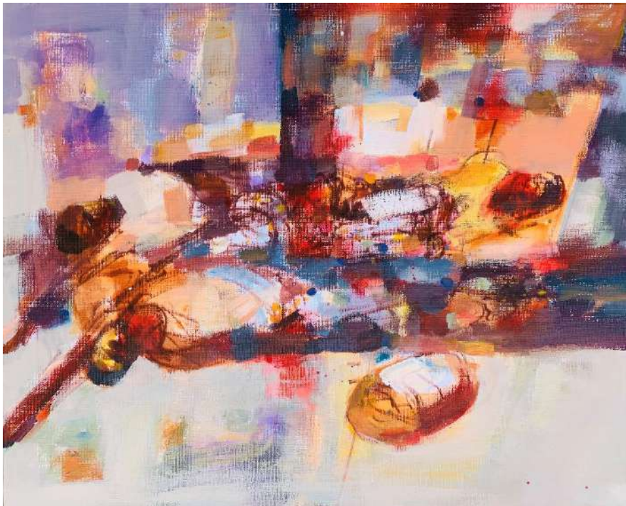
leaving the City VI, 2024 Mixed media on Canvas 50 x 40.5 cm