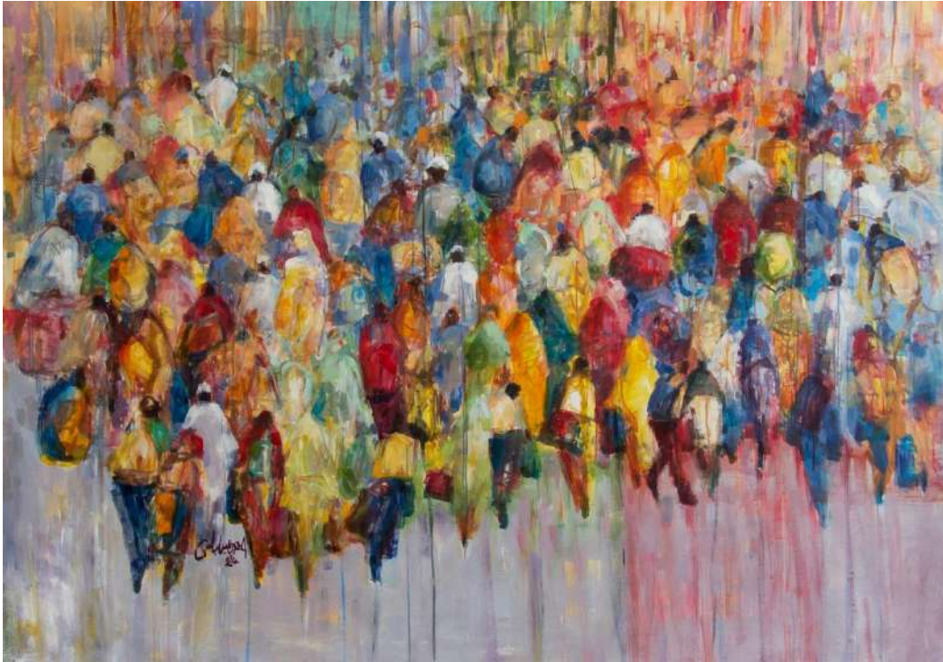
The Unchosen Ones V, 2024 Mixed media on Canvas 151 x 223 cm