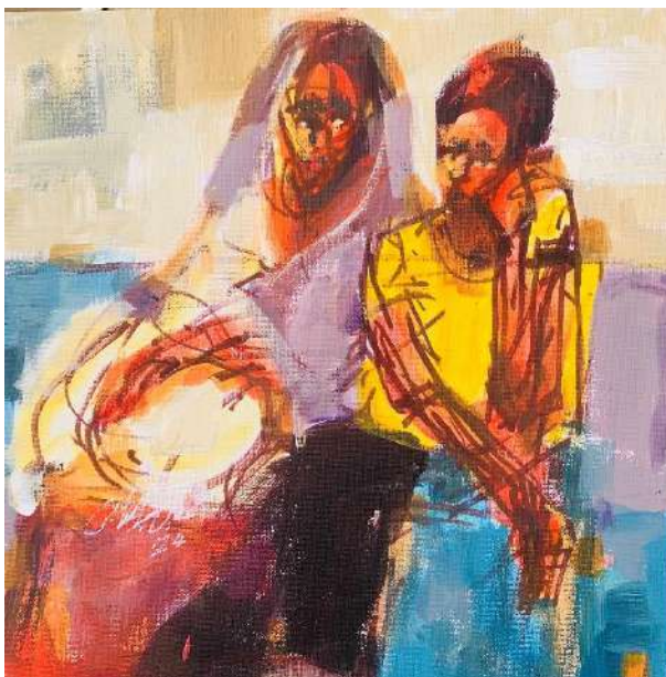
The Unchosen Ones II , 2024 Mixed media on Canvas 30 x 30 cm