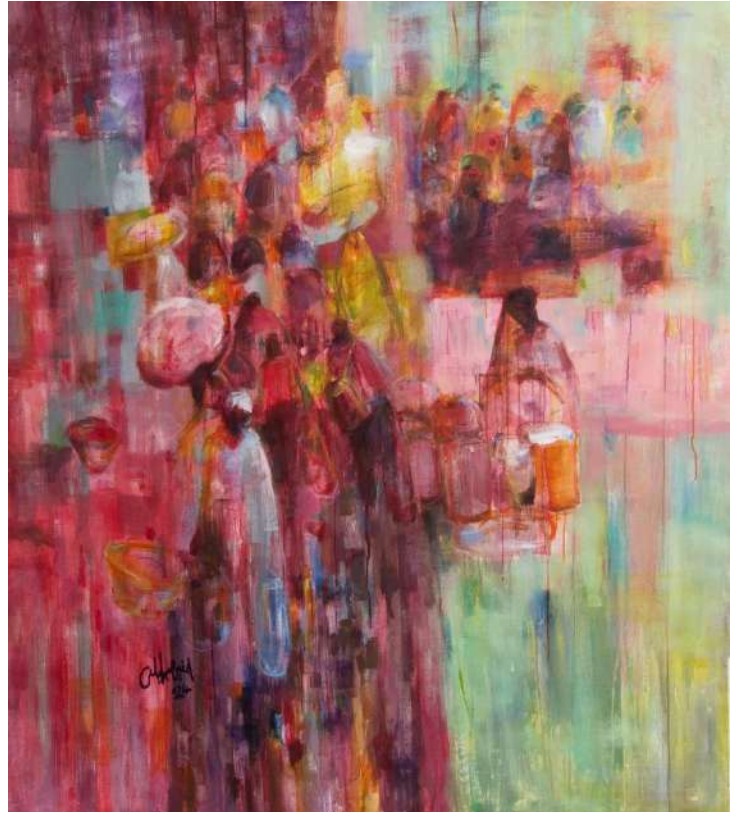
leaving the city VI, 2024 Mixed media on Canvas 129 x 100 cm