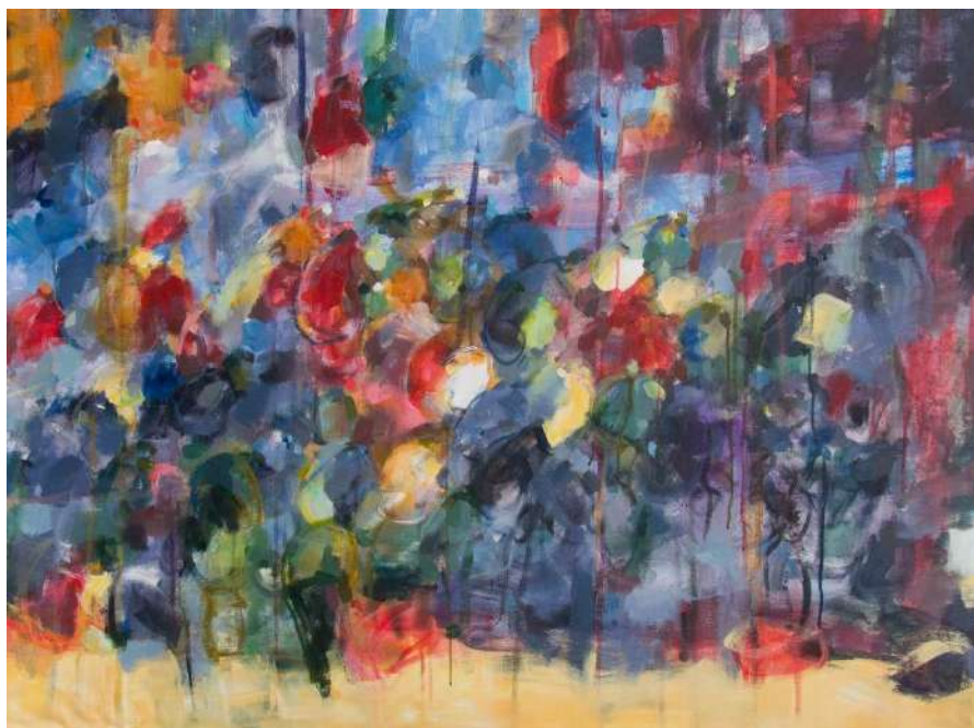
leaving the city II, 2024 Mixed media on Canvas 99 x 130 cm Panorama 1/3 paintings