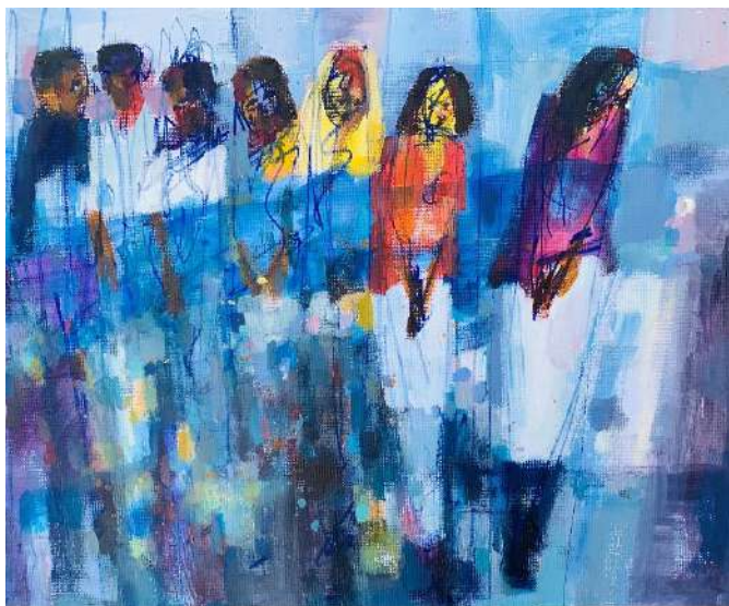
Scares Comes With Memories III, 2024 Mixed media on Canvas 50 x 40.5 cm