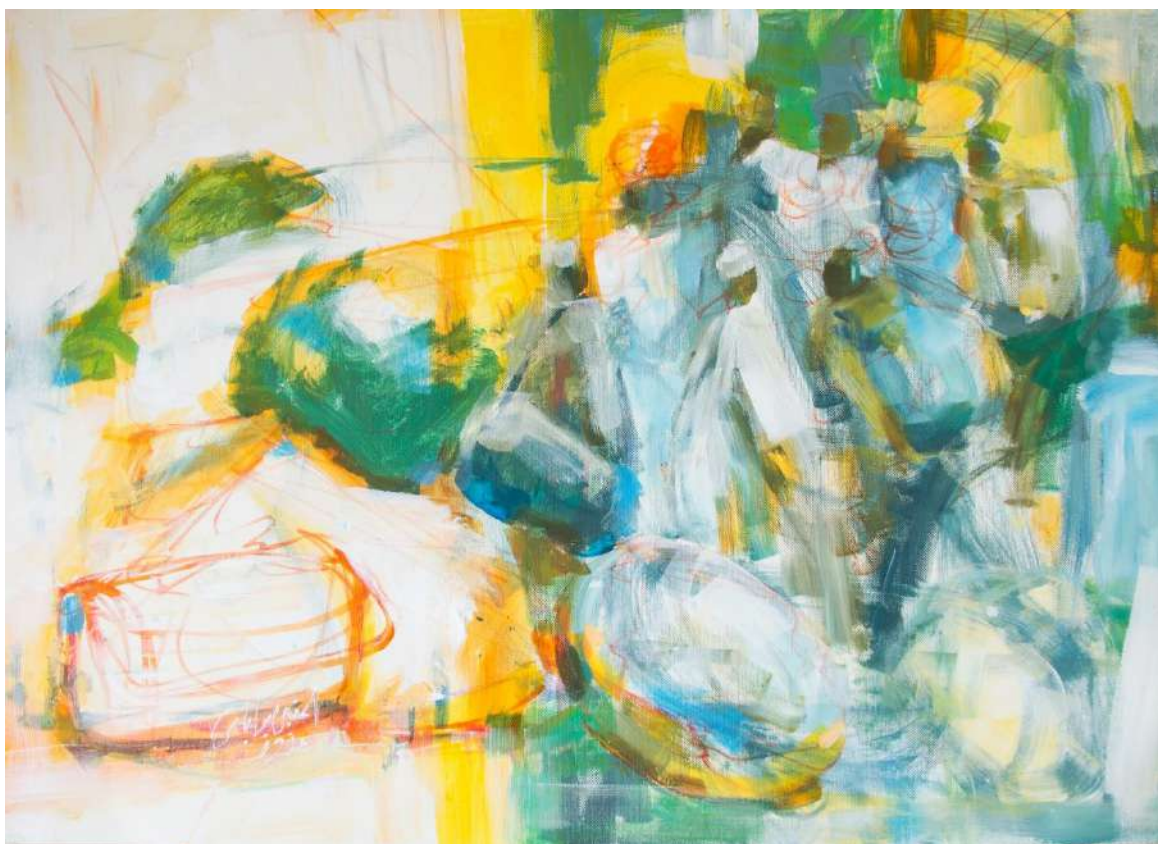
leaving the City II, 2024 Mixed media on Canvas 151 x 223 cm