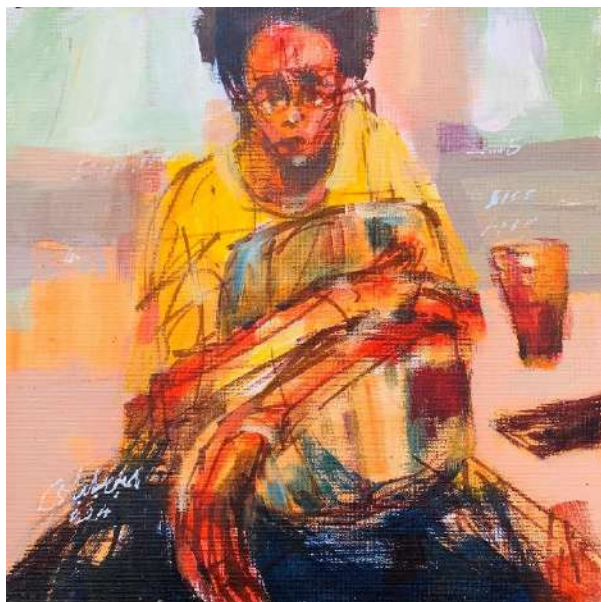
leaving the city III , 2024 Mixed media on Canvas 30 x 30 cm