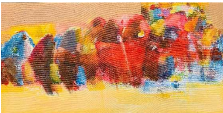
leaving the city III, 2024 Mixed media on Canvas 61 x 100 cm