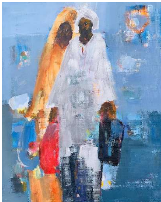
Scares Comes With Memories Mixed media on Canvas 50 x 40.5 cm