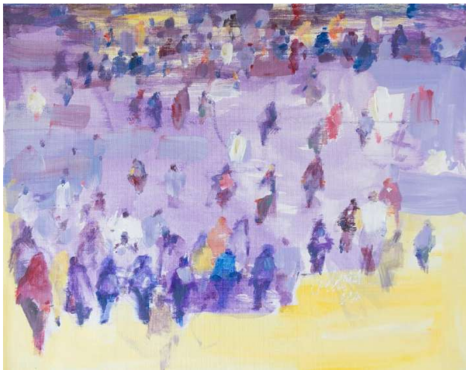
leaving the City II, 2024 Mixed media on Canvas 151 x 223 cm