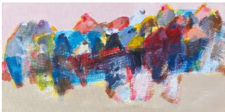
leaving the city III, 2024 Mixed media on Canvas 61 x 30 cm