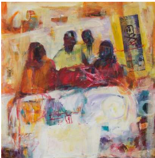
leaving the city VII, 2024 Mixed media on Canvas 129 x 100 cm