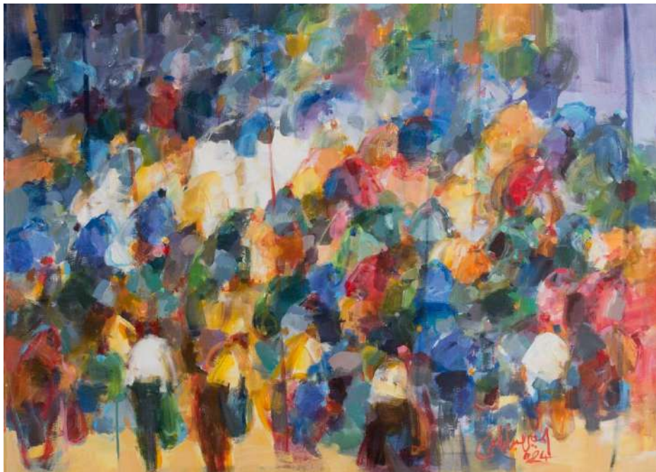
leaving the city III, 2024 Mixed media on Canvas 99 x 130 cm Panorama 2/3 paintings