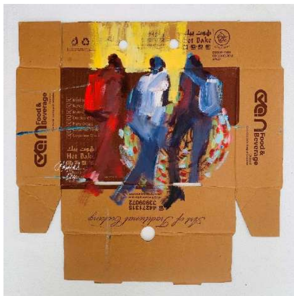
Faces Burned By Sun I, 2024 Mixed media on Recycled Cartoon 24 x 24 cm