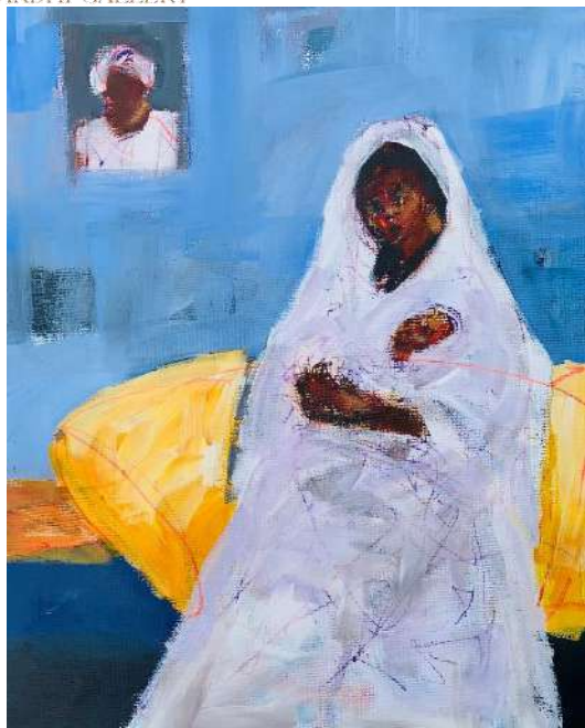
Scares Comes With Memories I, 2024 Mixed media on Canvas 50 x 40.5 cm