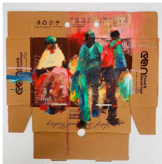
Faces Burned By Sun II, 2024 Mixed media on Recycled Cartoon 24 x 24 cm