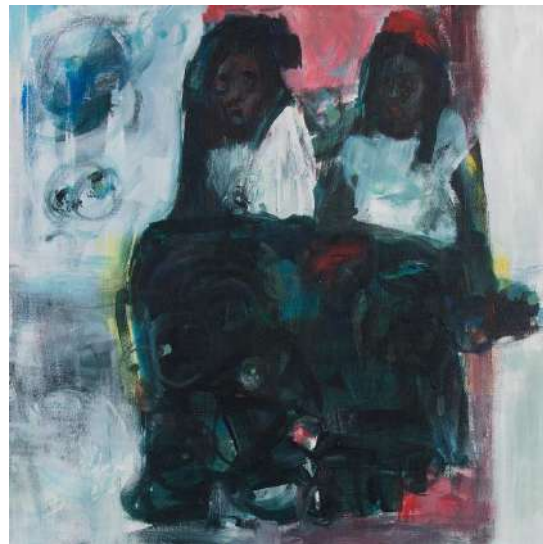
leaving the city VIII, 2024 Mixed media on Canvas 129 x 100 cm