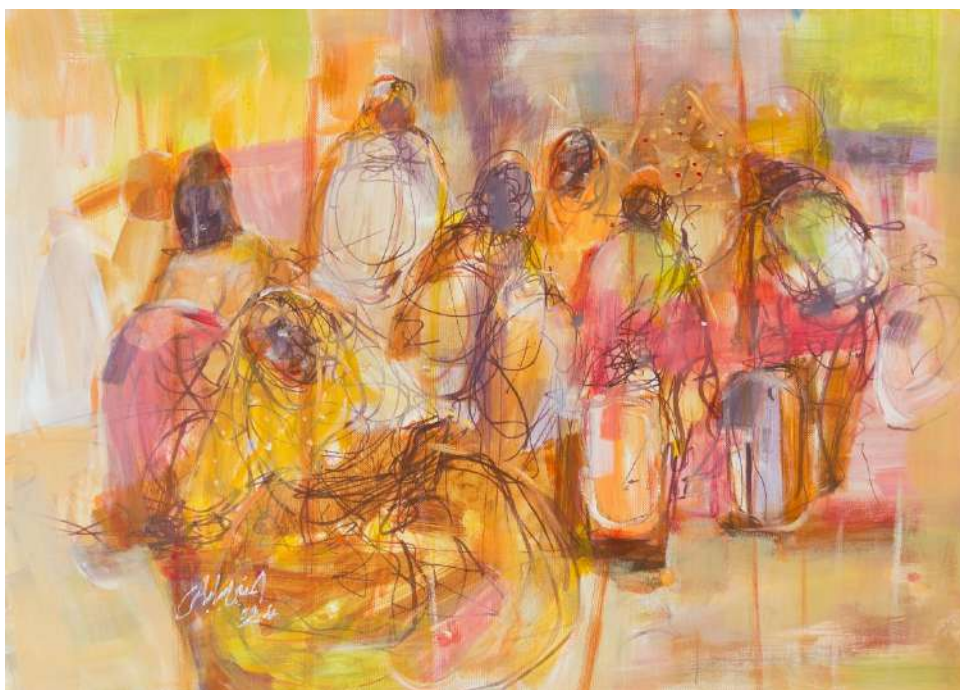
leaving the City II, 2024 Mixed media on Canvas 151 x 223 cm