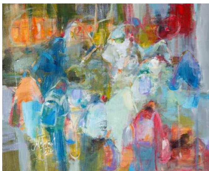
leaving the city III, 2024 Mixed media on Canvas 129 x 100 cm