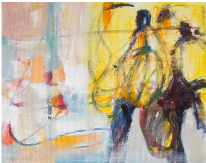
leaving the city III, 2024 Mixed media on Canvas 129 x 100 cm