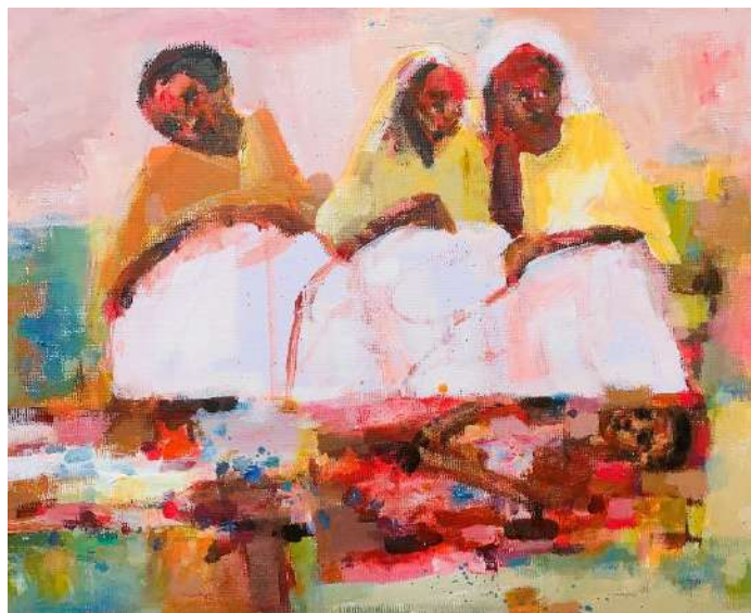
Scares Comes With Memories IV, 2024 Mixed media on Canvas 50 x 40.5 cm