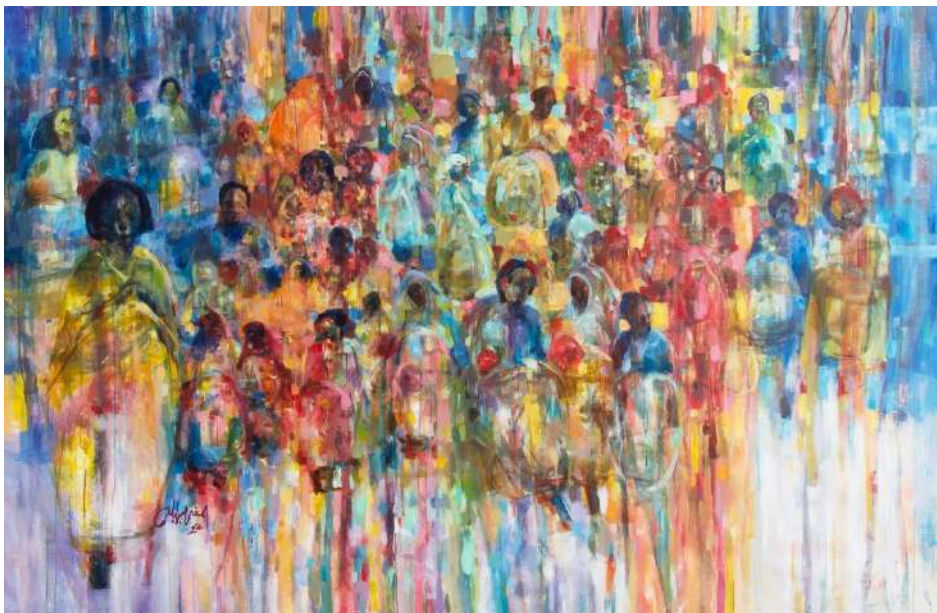
leaving the City I, 2024 Mixed media on Canvas 151 x 223 cm