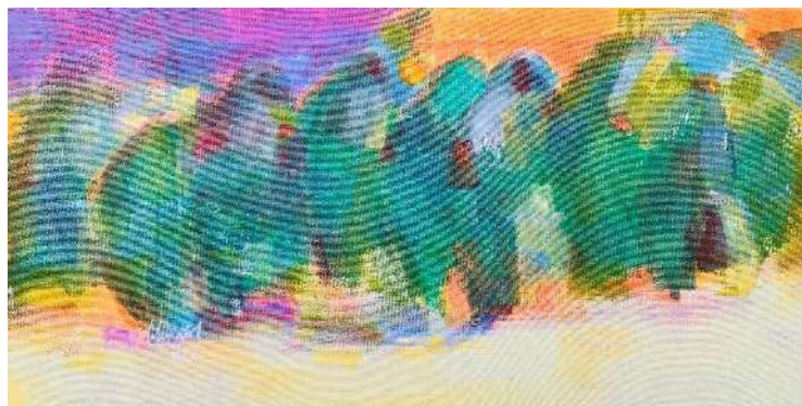
leaving the city III, 2024 Mixed media on Canvas 61 x 30 cm