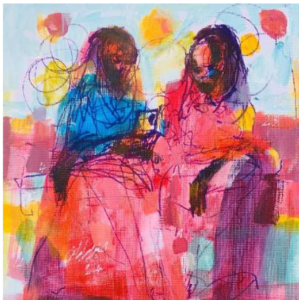
The Unchosen Ones I , 2022 Mixed media on Canvas 30 x 30 cm