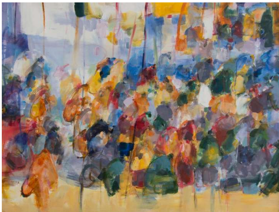
leaving the city IV, 2024 Mixed media on Canvas 99 x 130 cm Panorama 3/3 paintings