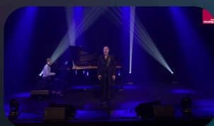
"The Impossible Dream"