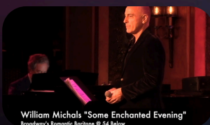
"Some Enchanted Evening"