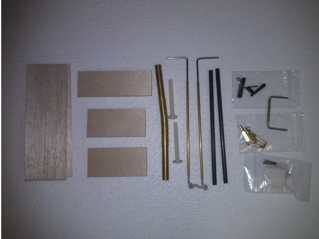
TA-152 Kit Contents – Small Parts (Typical)