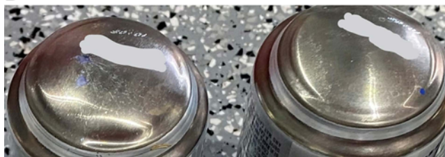
Figure 6. Visual deformation (buckling) of the can lid (A) or dome (B).