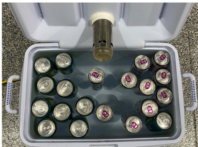
Figure 5. A water bath consisting of a cooler and sous vide device worked used as a stand-in for small-batch pasteurizers.