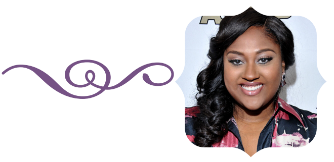
Jazmine Sullivan - April 9 Singer-songwriter "It makes the quality of living so much better when you just appreciate where you are."

R&B and gospel singer and songwriter "Enjoy the little things in life, because one day you will look back and realize they were the big things."