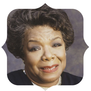
Maya Angelou - April 4 Poet, singer, and civil rights activist.

Taking inspiration from phenomenal black women born in April.